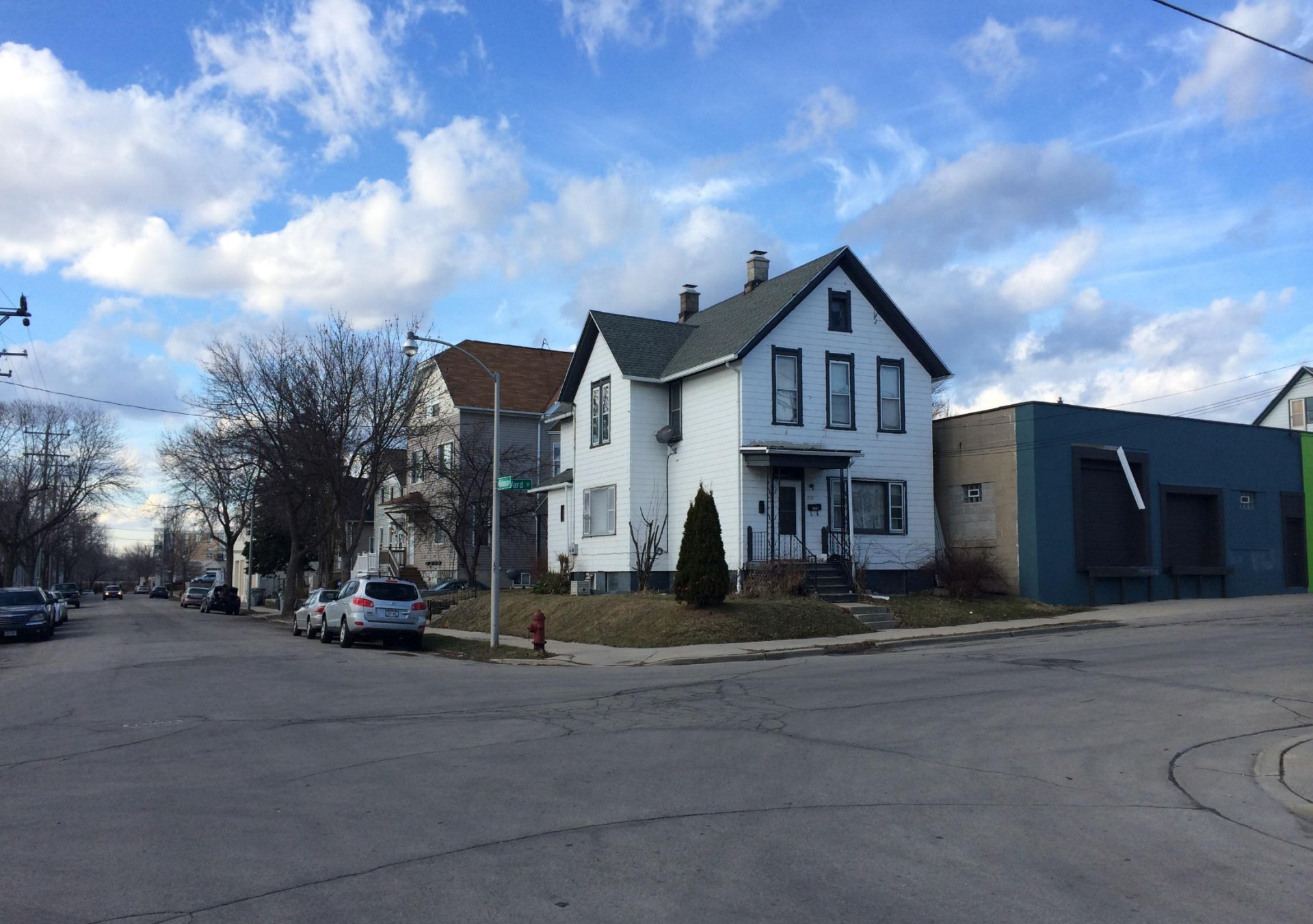
Site Context | Ward Street & Robinson Avenue