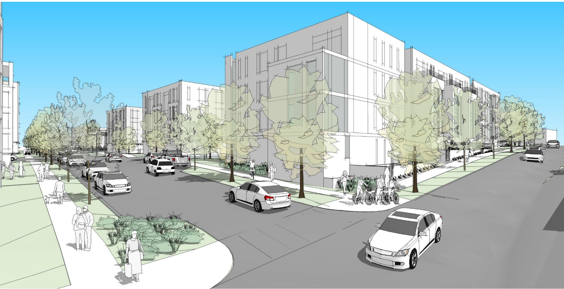
Ward Street | Pedestrian View