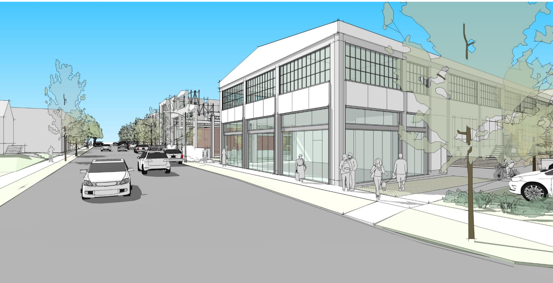
Robinson Avenue | Retail/Residential View