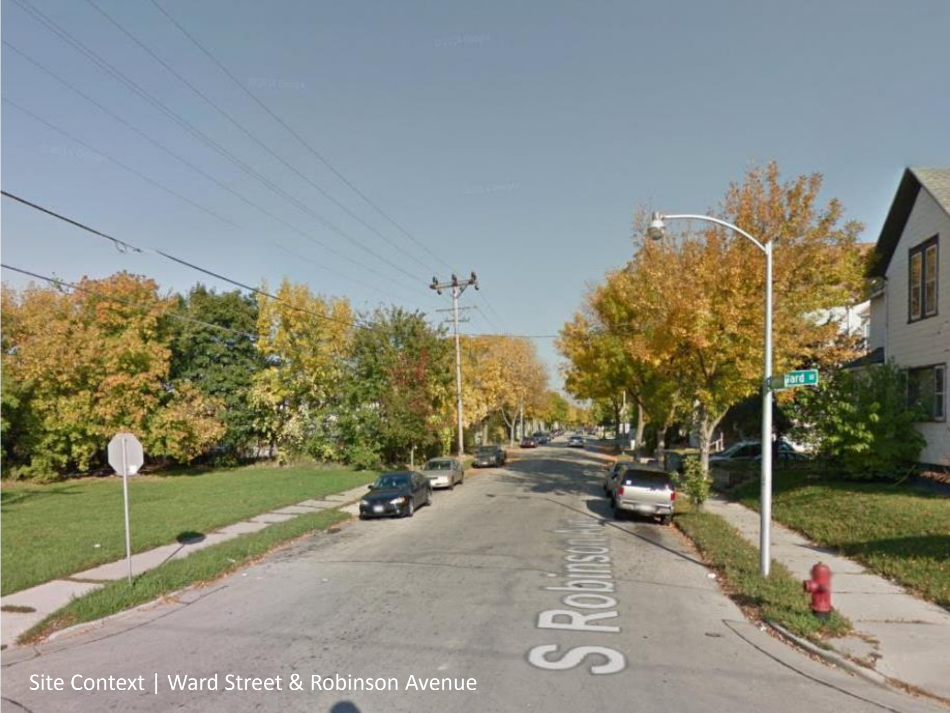
Site Context | Ward Street & Robinson Avenue