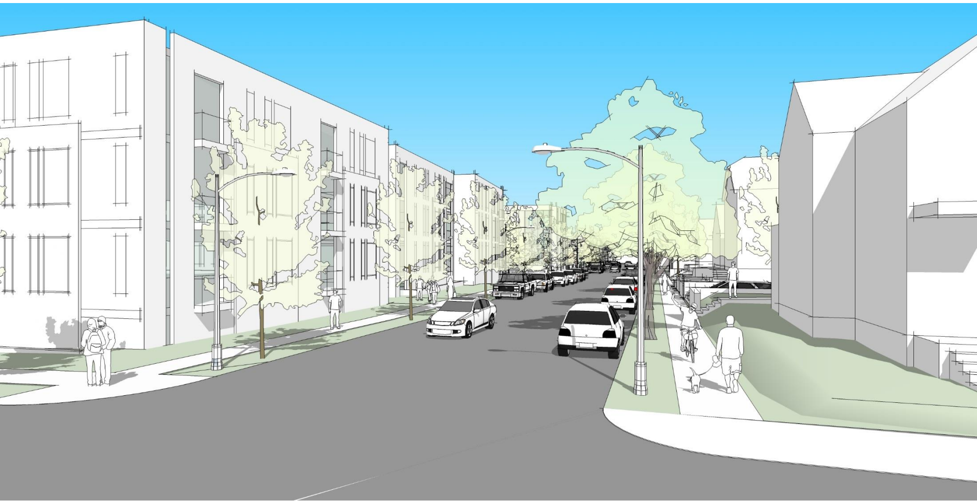
Ward Street & Robinson Avenue | Pedestrian View