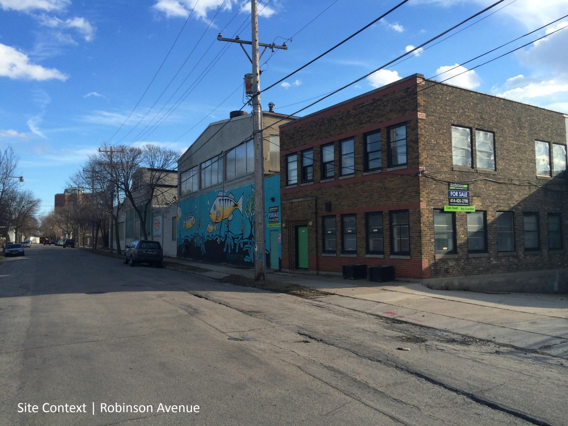
Site Context | Robinson Avenue