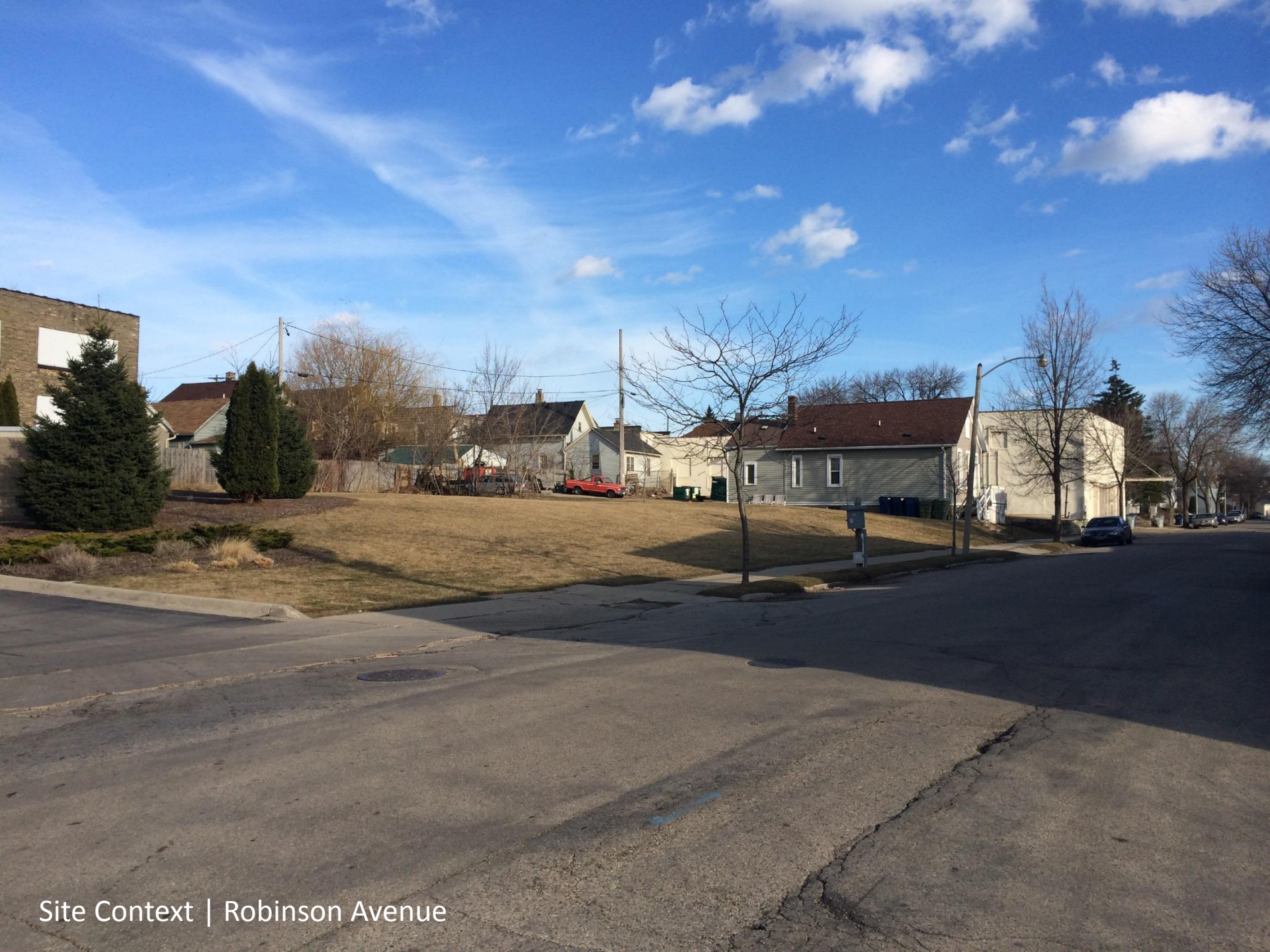
Site Context | Robinson Avenue