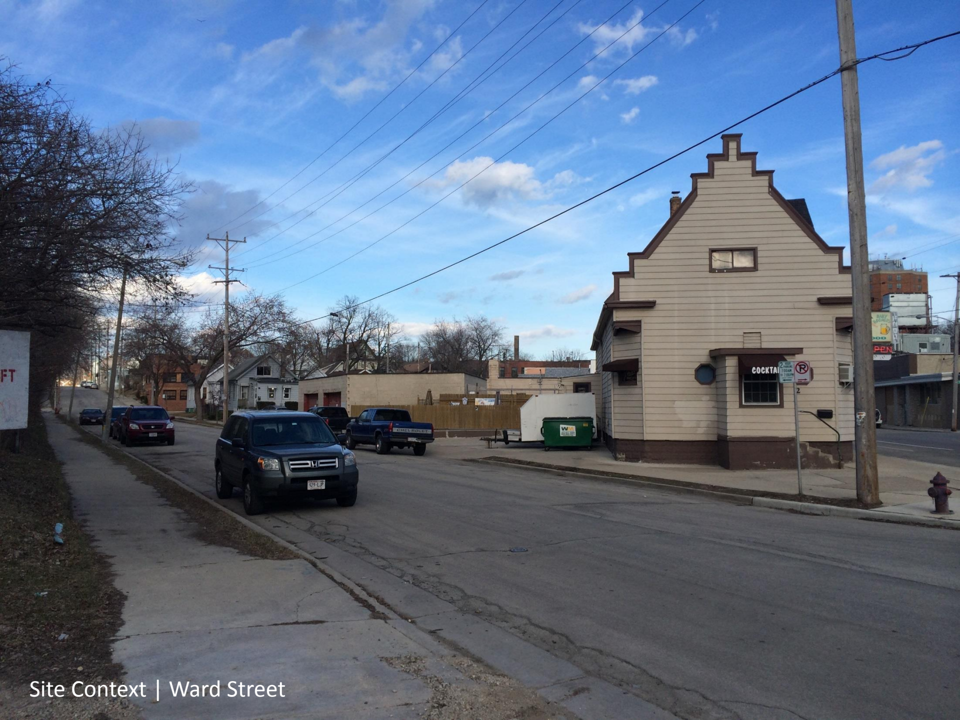
Site Context | Ward Street