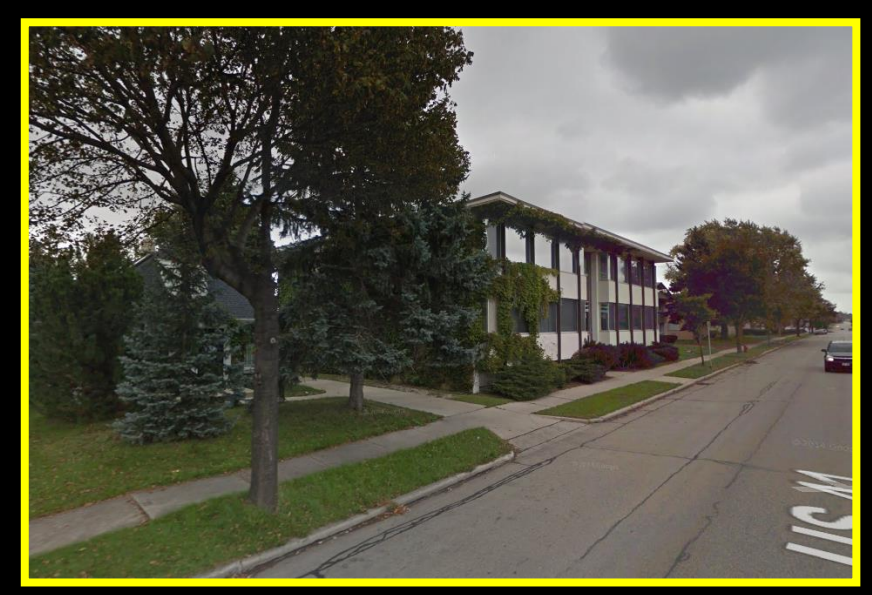
View looking southeast from West Appleton Avenue