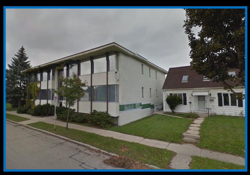
View looking north from West Appleton Avenue