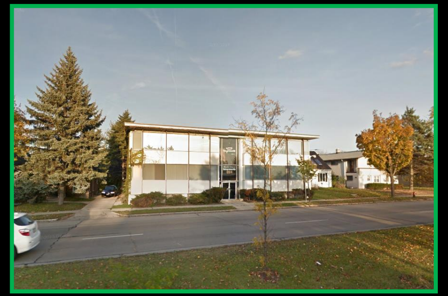
View looking east from West Appleton Avenue