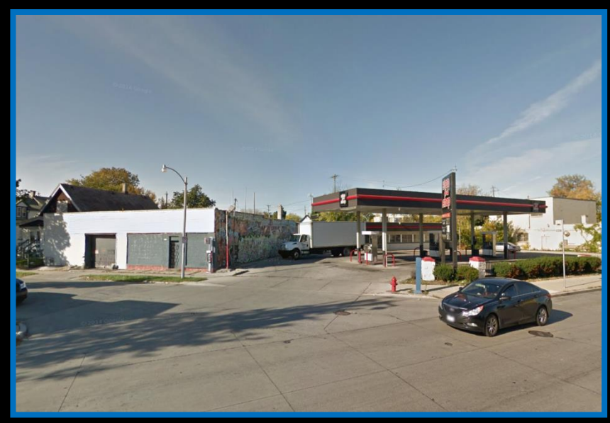
View looking west from West Fond Du Lac Avenue