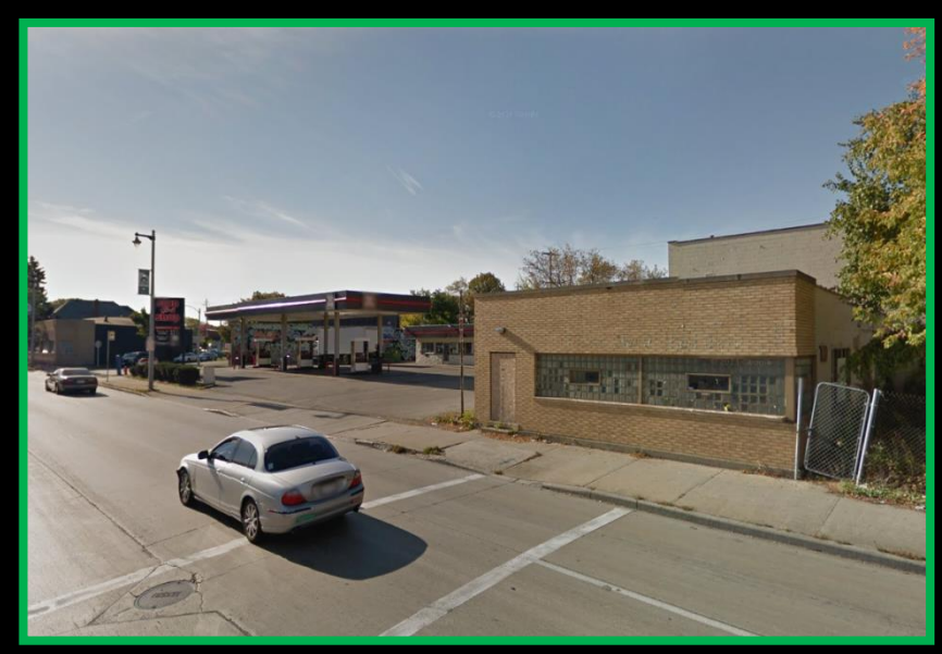
View looking south from West Fond Du Lac Avenue