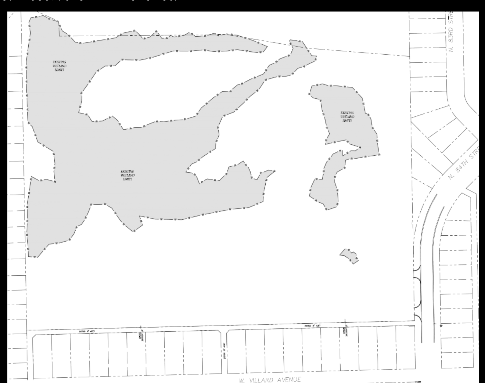
File No. 140867. Site with Wetlands.