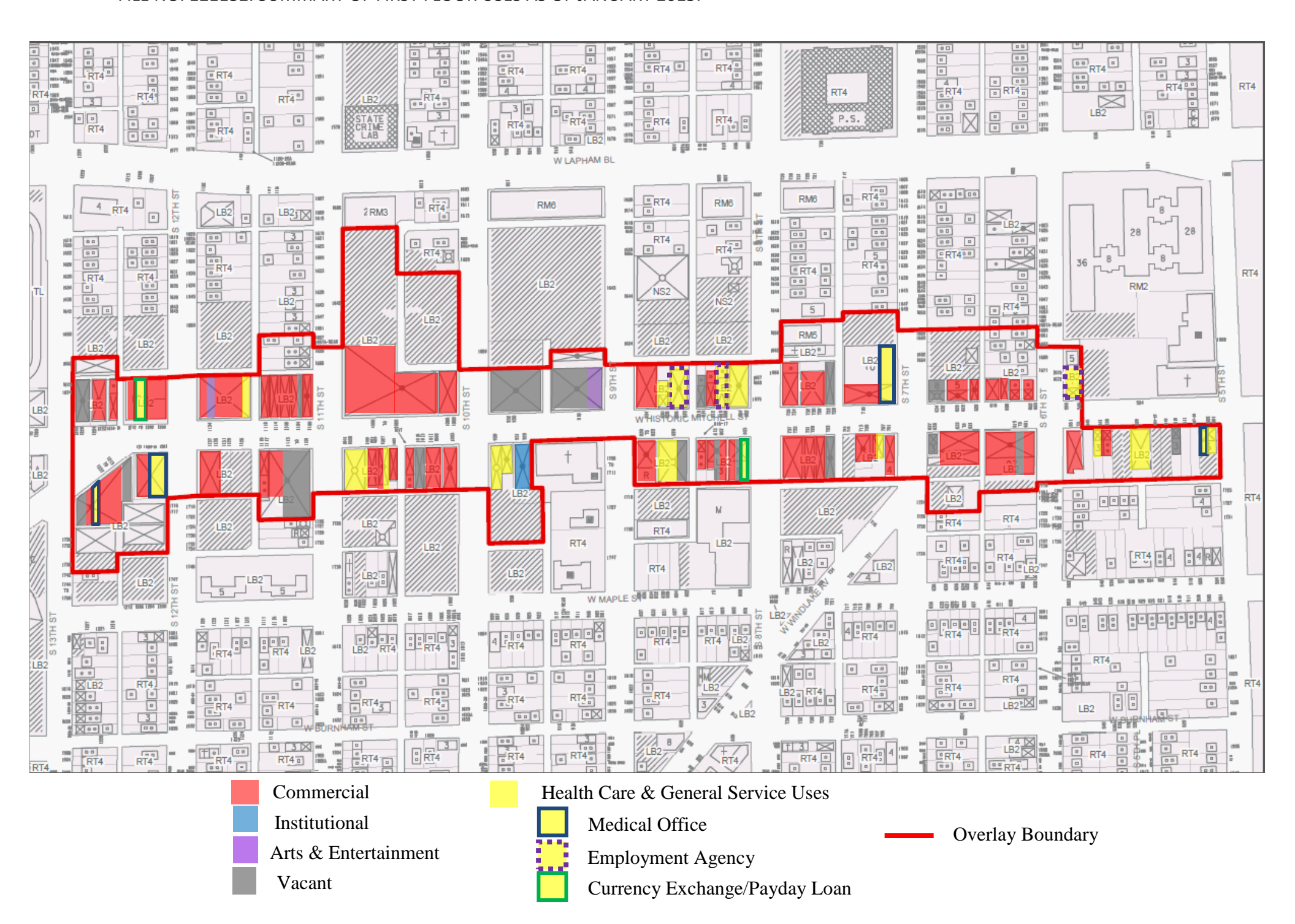
FILE NO. 121132. SUMMARY OF FIRST FLOOR USES AS OF JANUARY 2015.