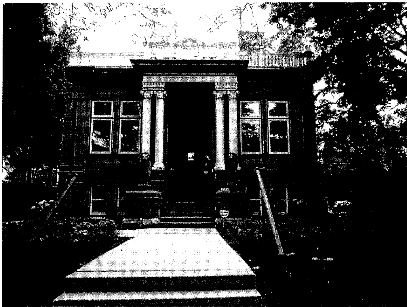
Front entrance to the George Koch House also known as the Lion House