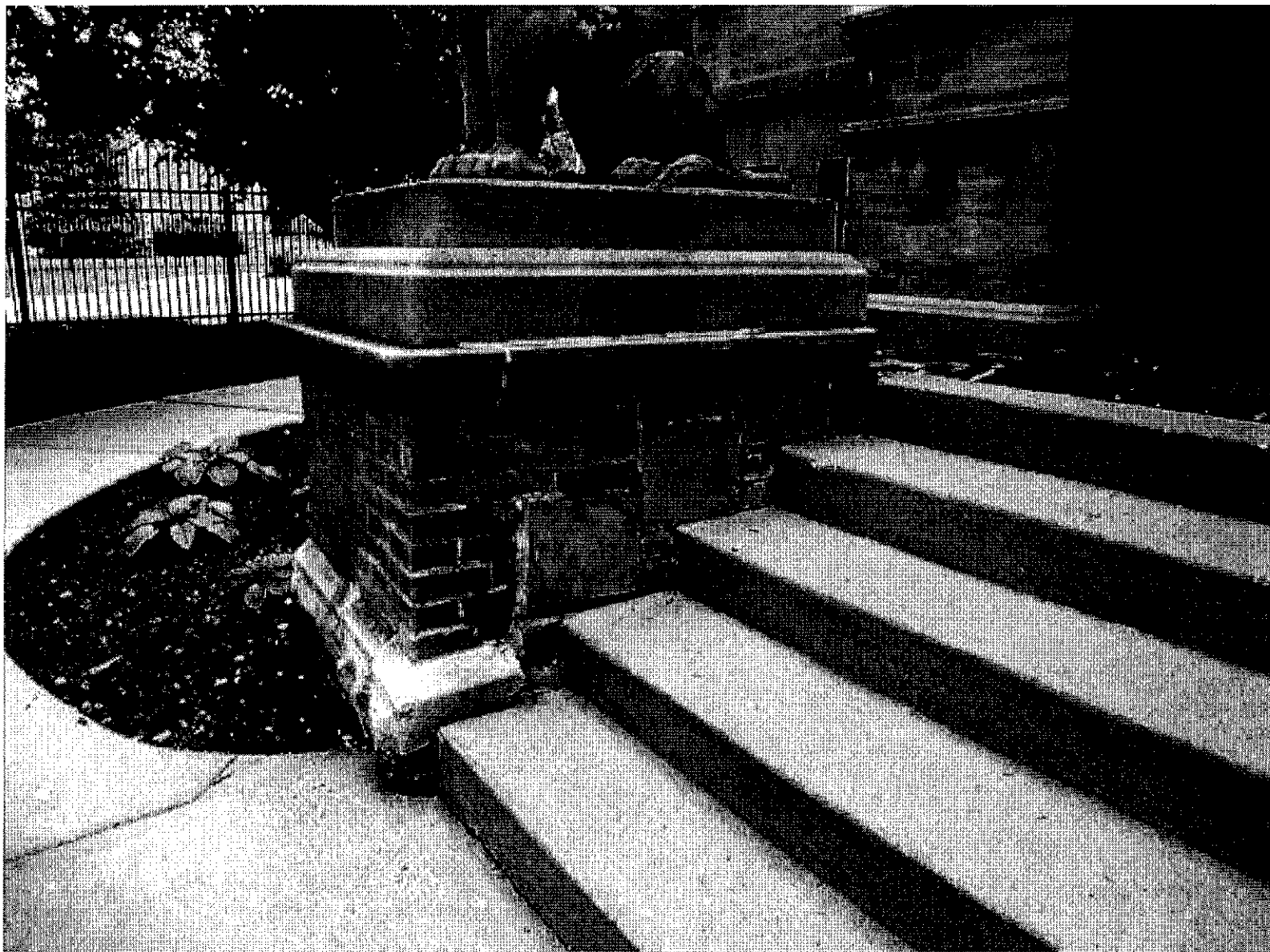
East cheek or wing wall. Concrete steps new. No railing existed historically at this location.