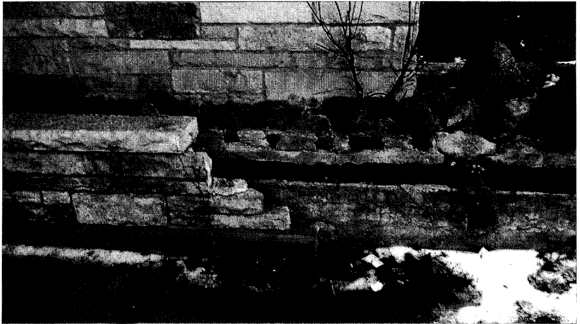
Detail of Lannon stone and River Rock