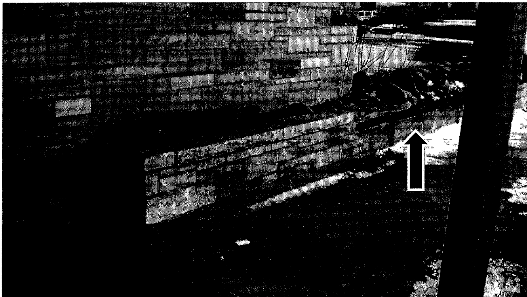
Lannon stone clad planter is original to the building's design. River rock replaced plantings c. 1970s. Vandalism has resulted in loss of stone veneer.