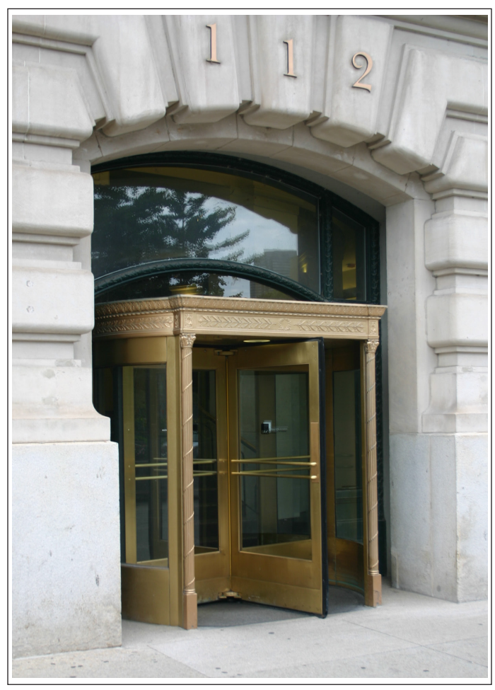
Historic building vestibule, distinct form but within property line

Design Guideline: Vestibules exterior to the building's façade are discouraged on buildings classified as Pivotal by the Historic District designation, (see page 6). Proposals for this type of Alteration will be closely reviewed by the Architectural Review Board. A Special Privilege Permit from the City may also be required,