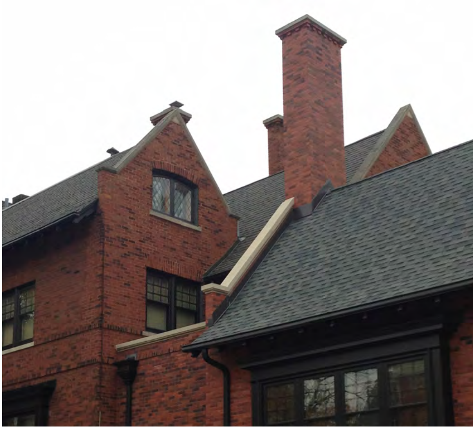
GABLE ROOF, PARAPET WALLS