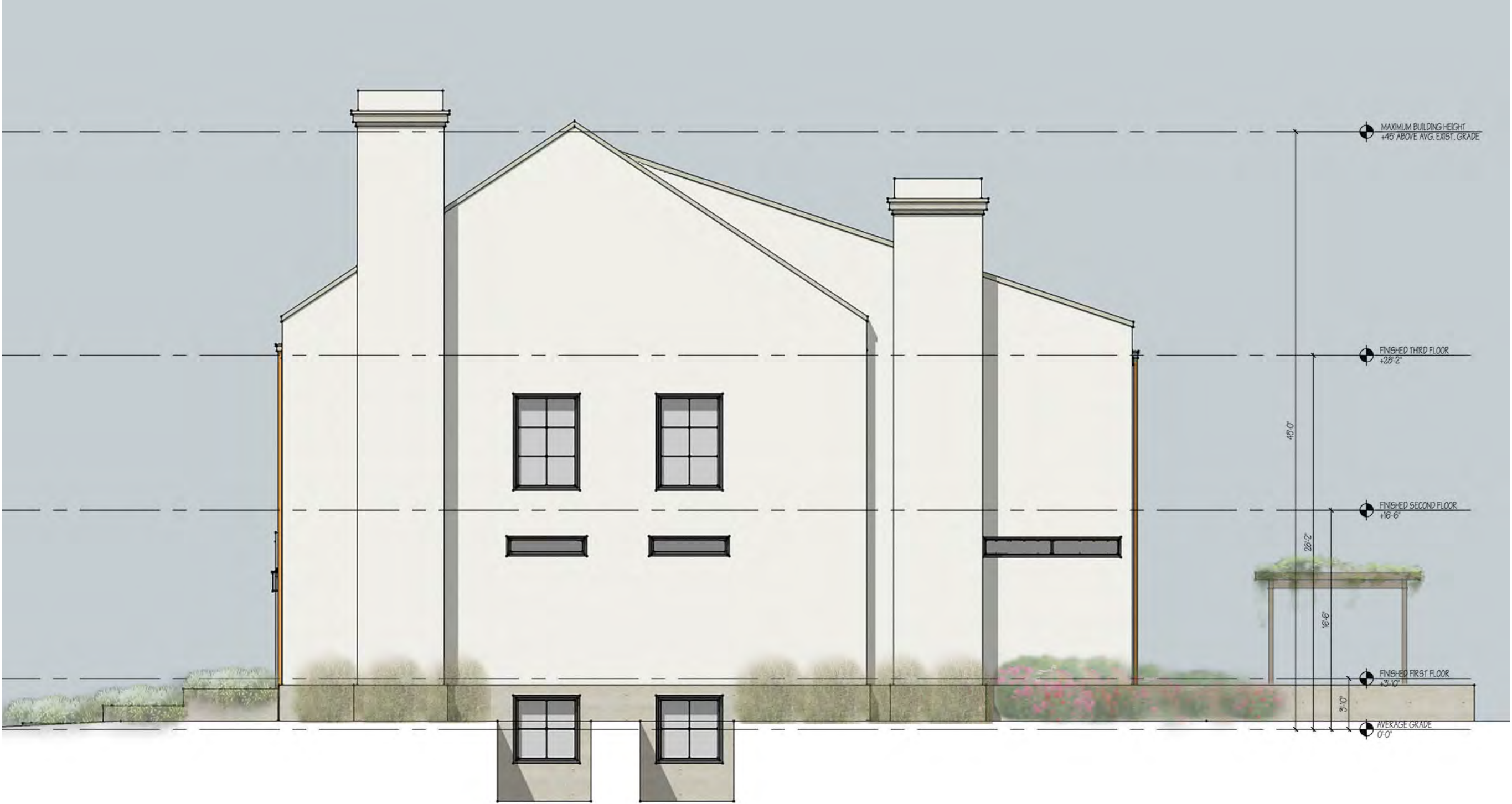
TERRACE AVE RESIDENCE NORTH ELEVATION