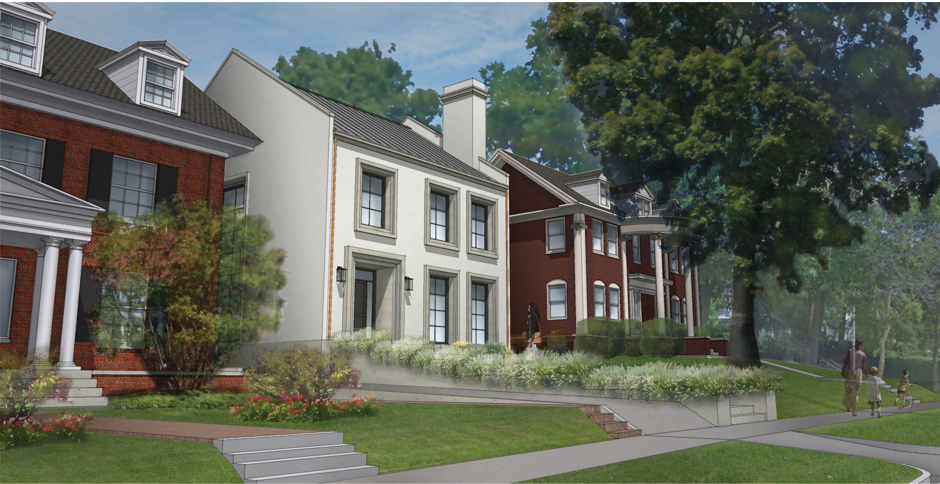
TERRACE AVE RESIDENCE SOUTHEAST PERSPECTIVE