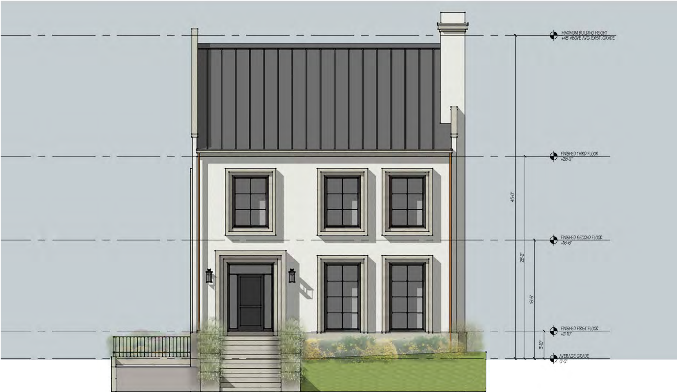
TERRACE AVE RESIDENCE EAST ELEVATION