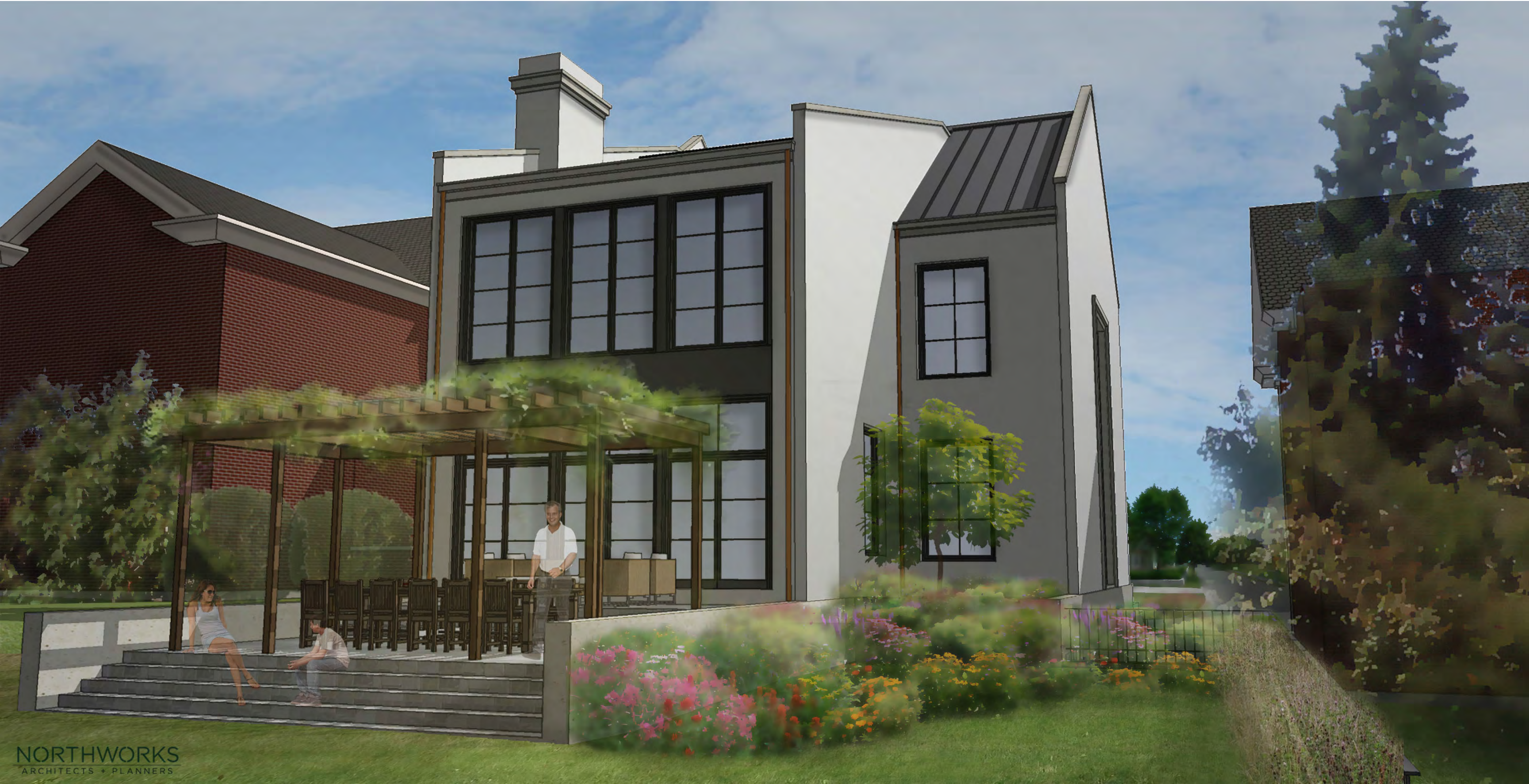
TERRACE AVE RESIDENCE REAR YARD PERSPECTIVE