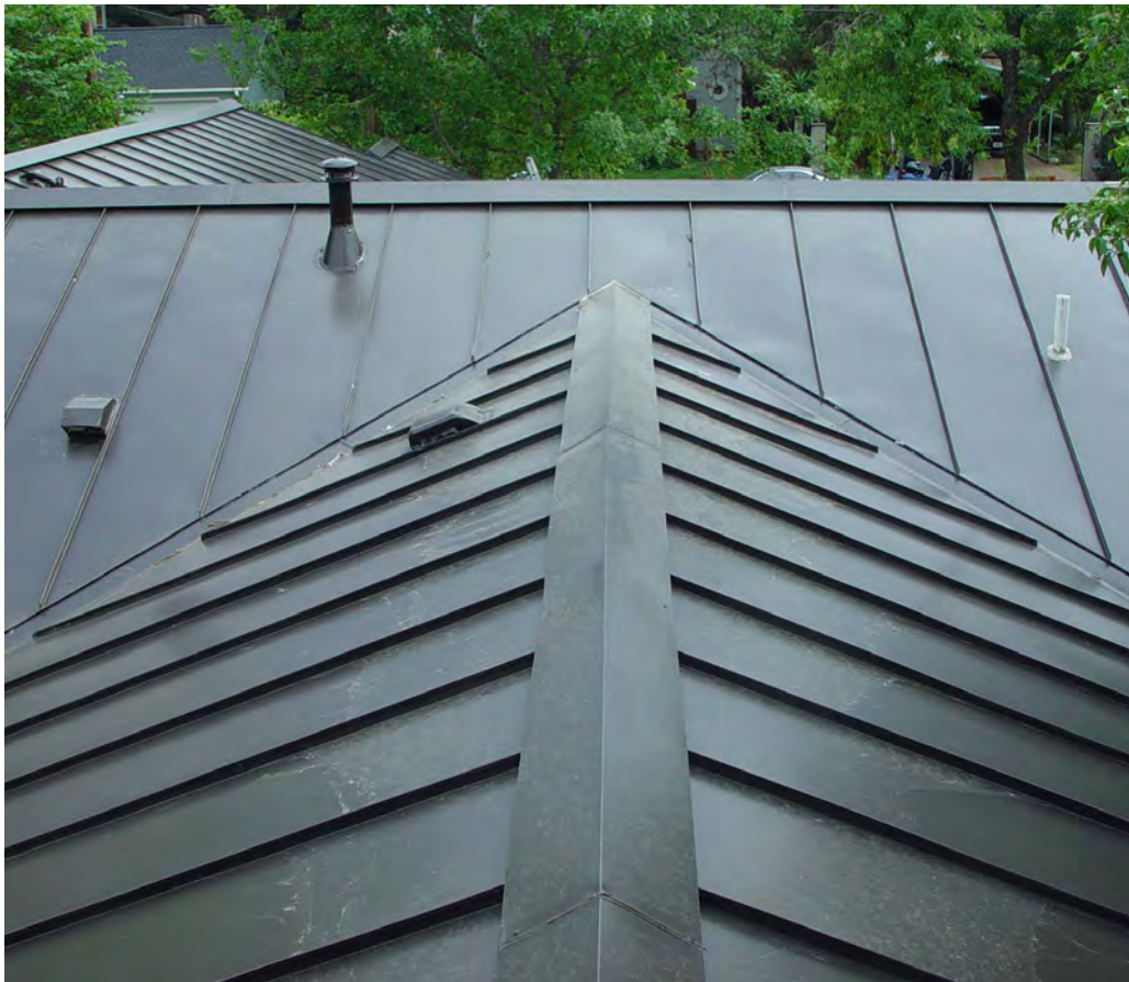
PRE-FINISHED STANDING SEAM METAL OR SIM.