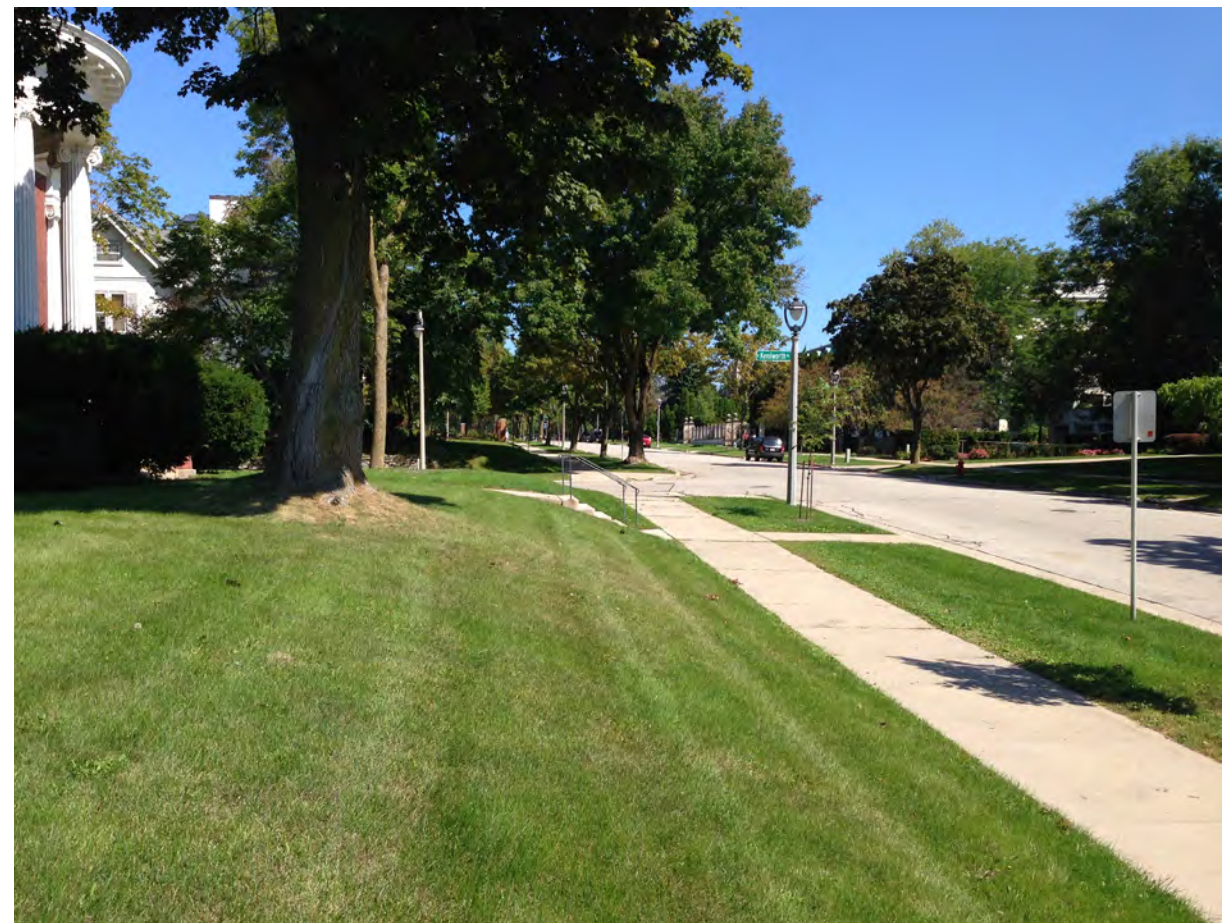
TERRACE AVE RESIDENCE EXISTING PROPERTY