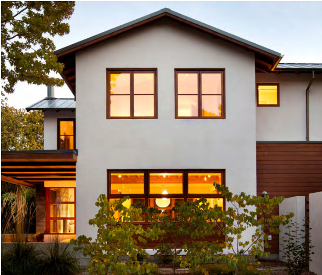
DARK WINDOW FRAMES