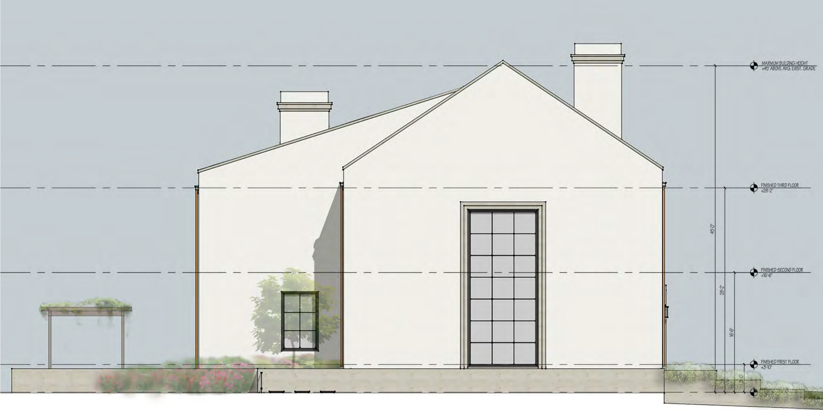
TERRACE AVE RESIDENCE SOUTH ELEVATION