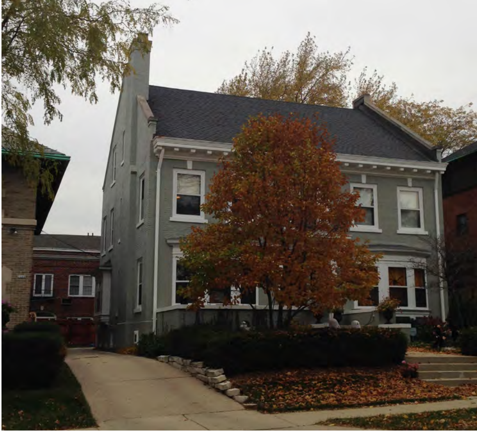
GABLE ROOF, PARAPET WALLS