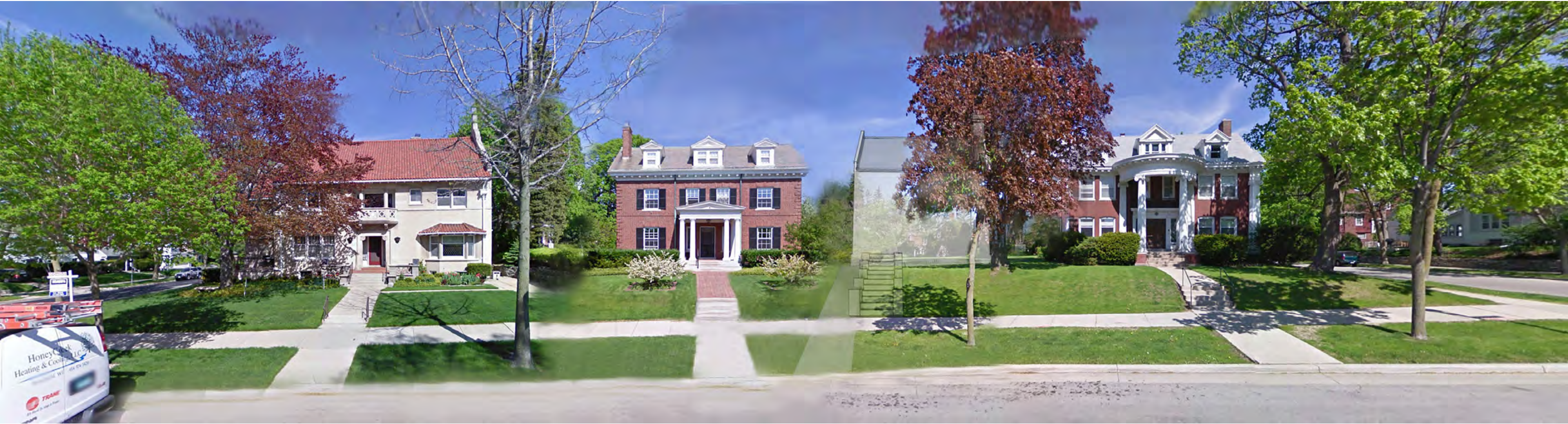
PROPOSED MASSING VOLUME