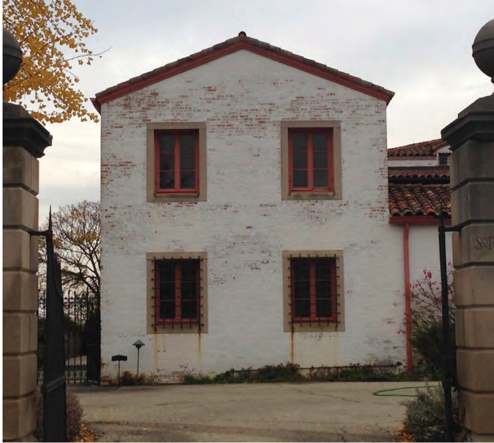
SIMPLE FENESTRATION, LIMESTONE TRIM