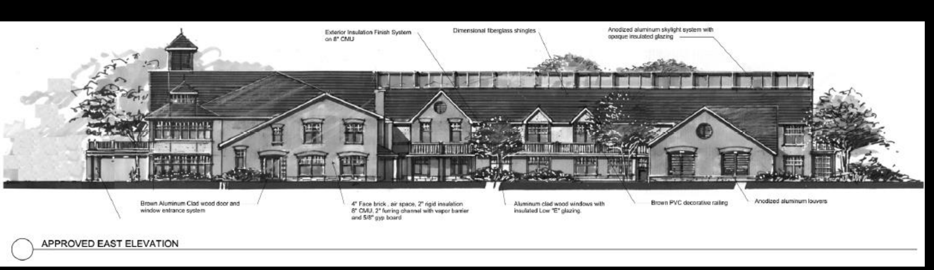
Facing N. 24th St