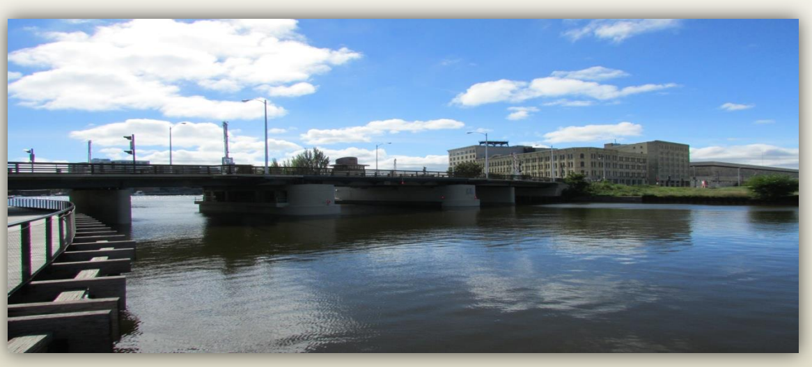
St. Paul Ave. Bridge re-opened on June 11, 2014