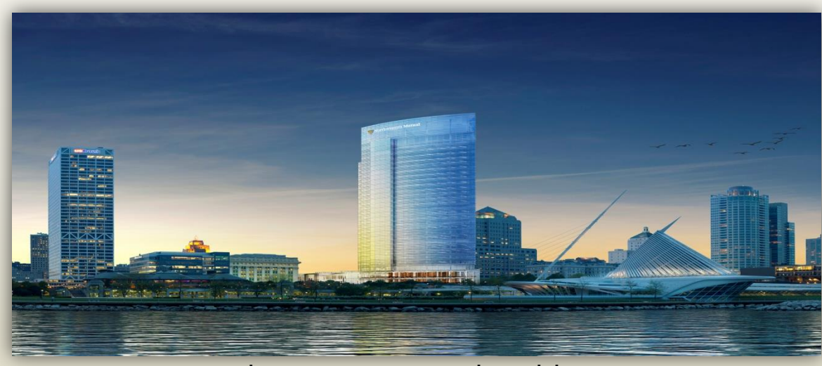
Northwestern Mutual Building