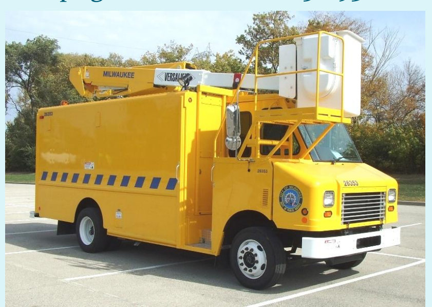
Lamplighter Aerial lift $156,936