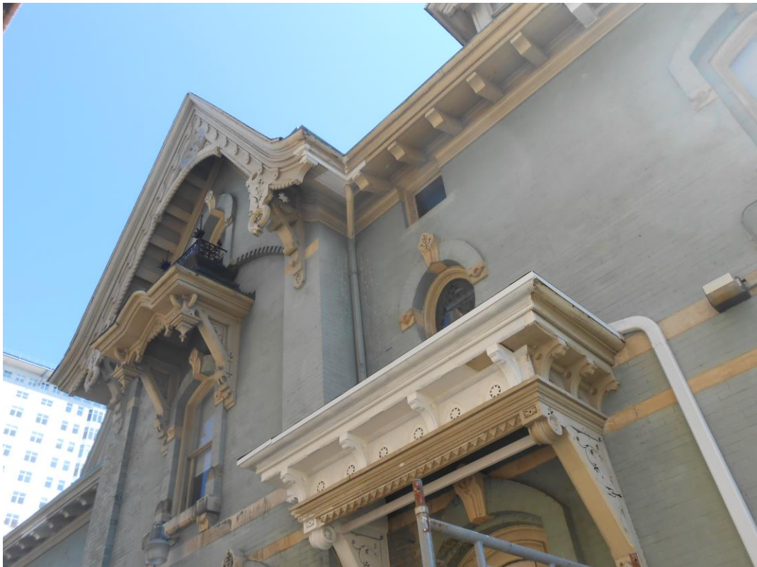
6. West Elevation Details