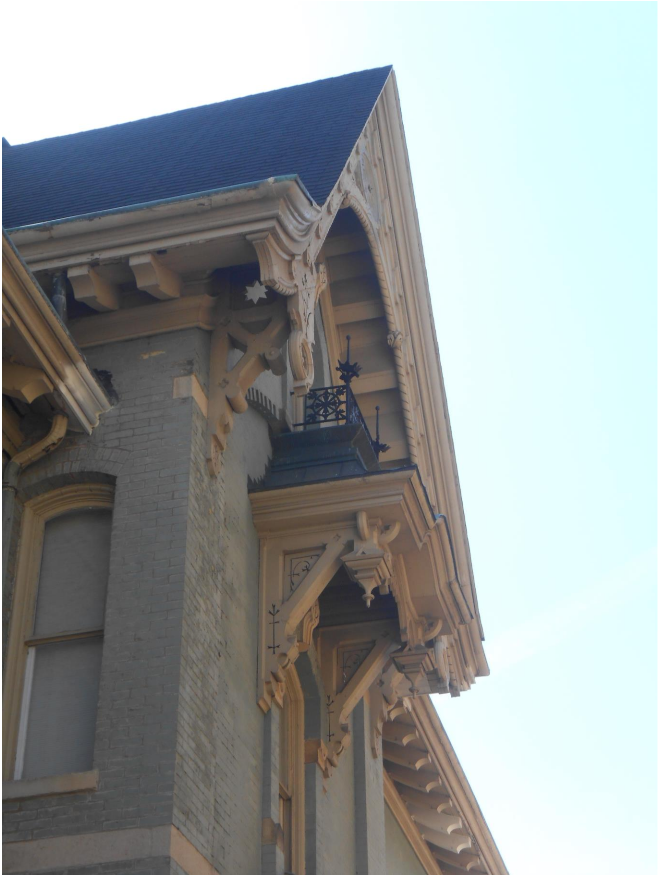
10 Bay Detail