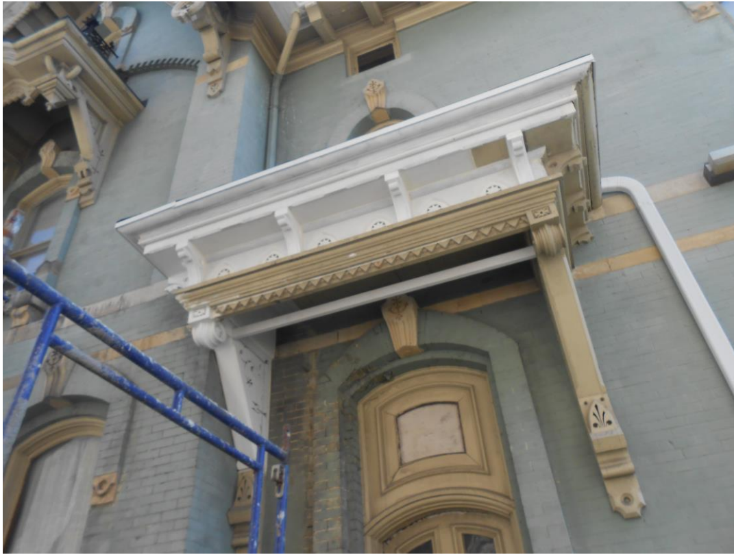
7. West Elevation Detail