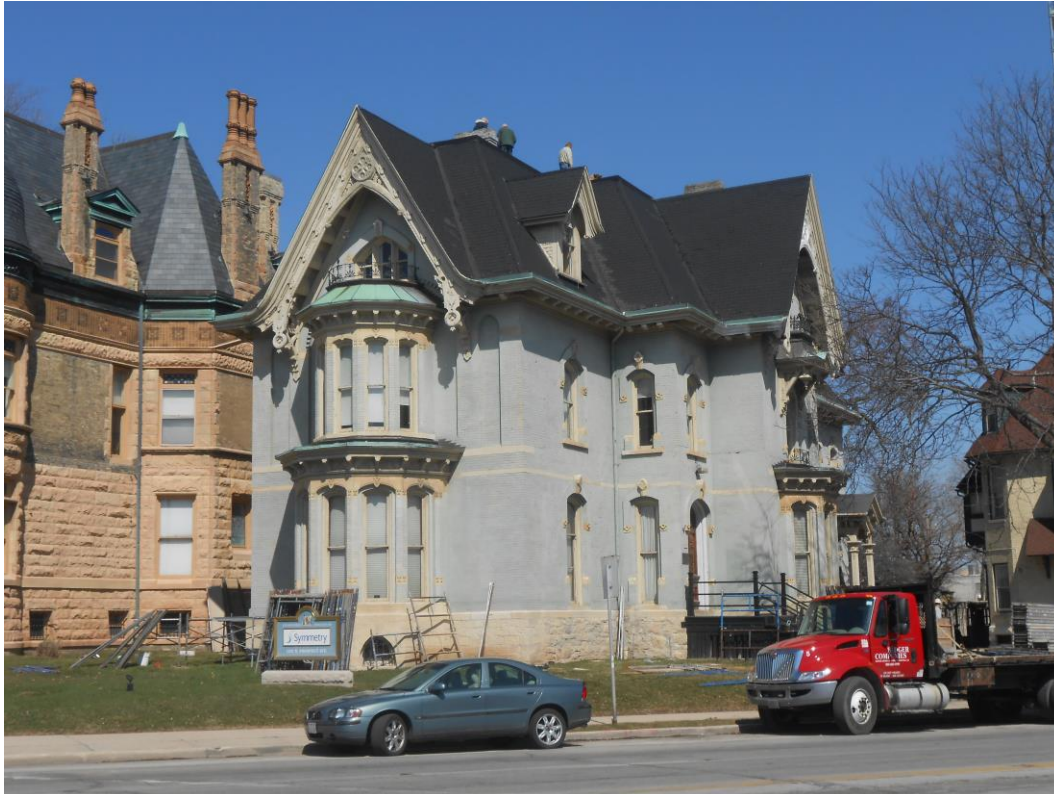
2. Southeast Corner