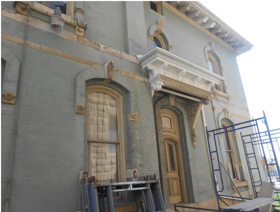
8. West Elevation Detail