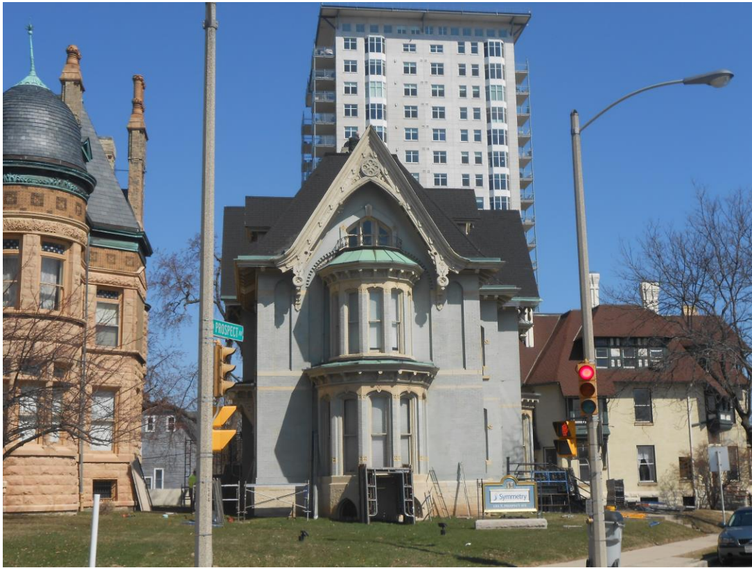
3. South Elevation