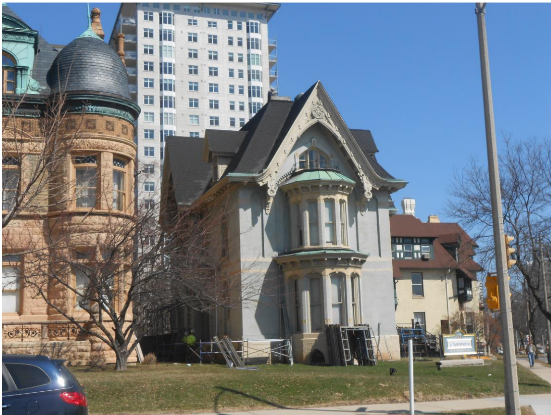
4. South Elevation