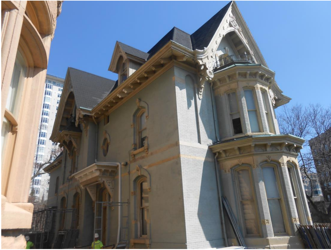
5. Southwest corner