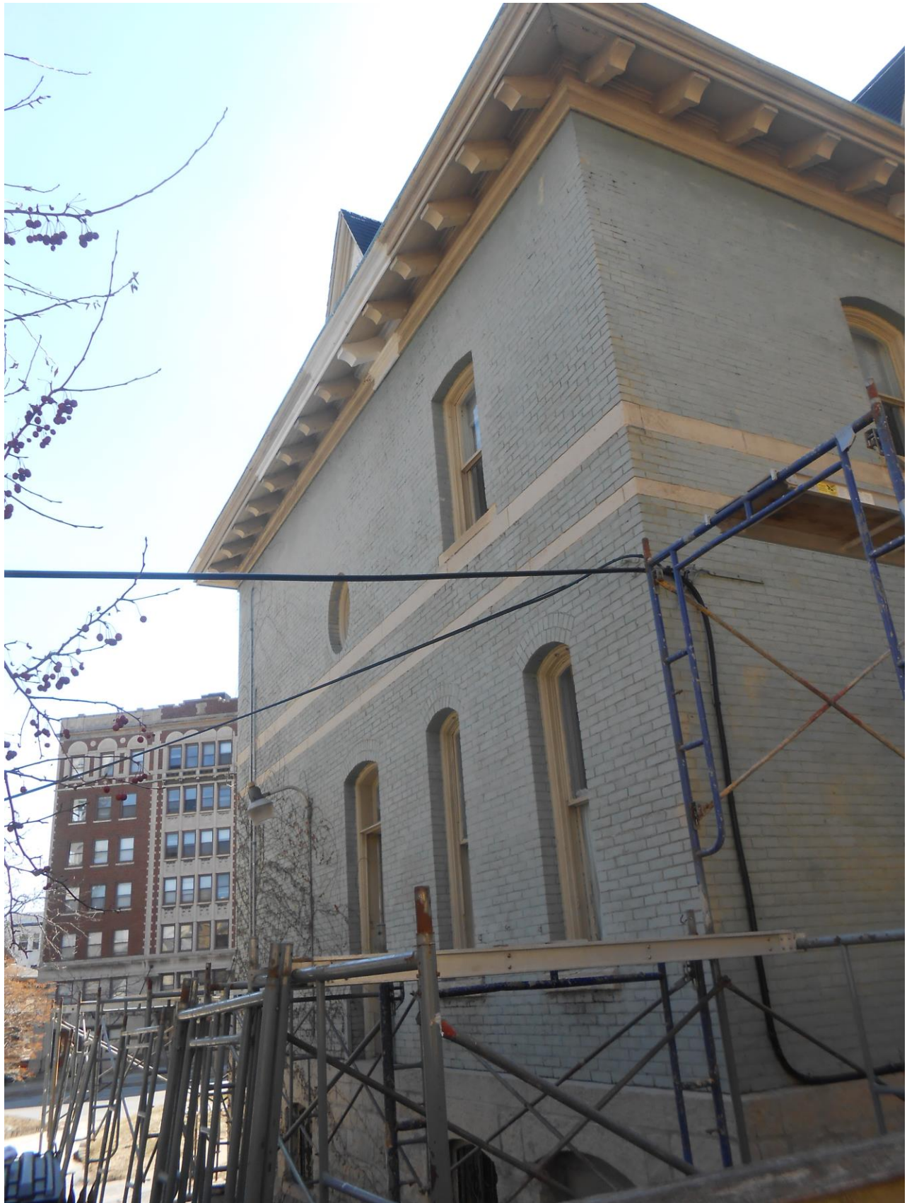
11. North Elevation