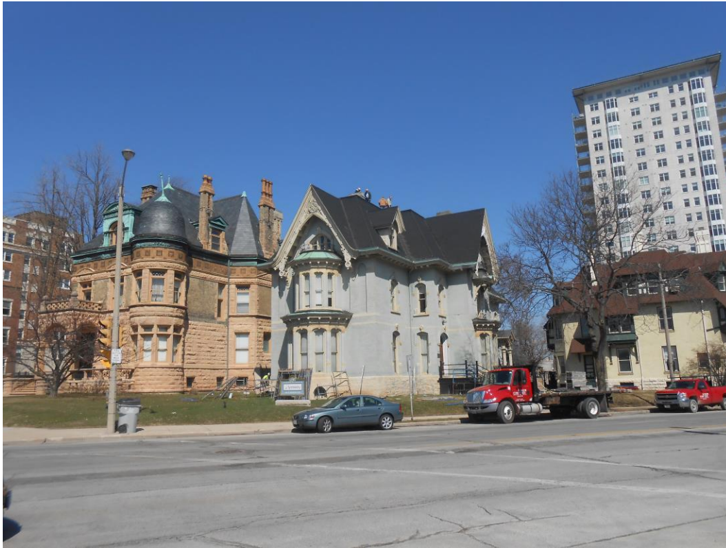
1. Southeast Corner