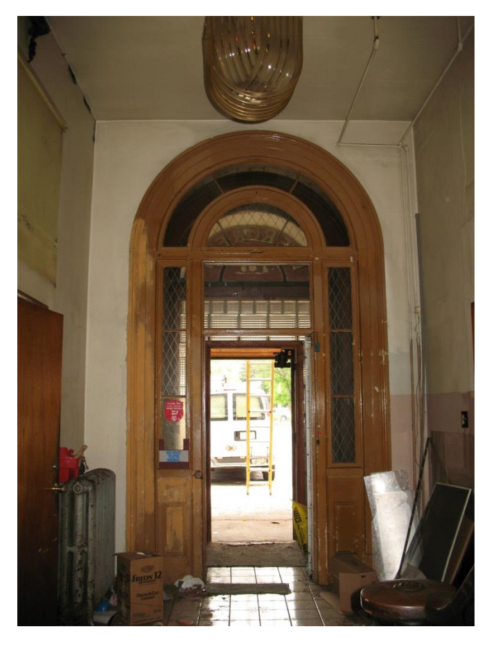
Front entrance from Interior