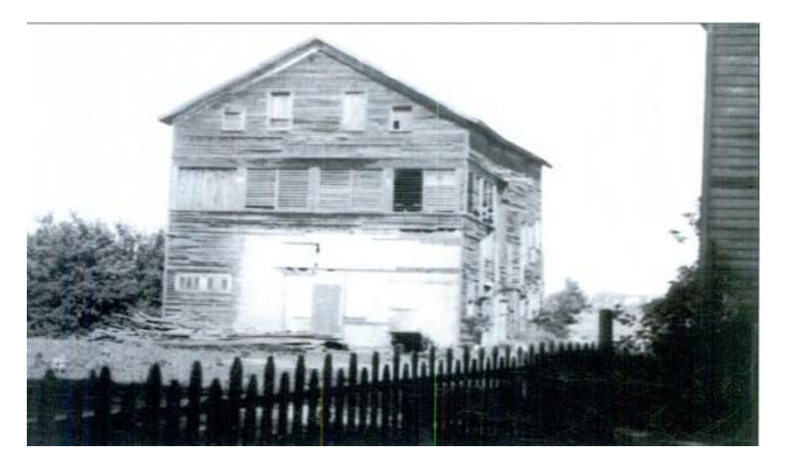
Distillery c. 1930s

Consideration will be given as to whether or not the proposed demolition is a later addition that is not in keeping with the original design of the structure or does not contribute to its character. On the Nunnemacher Estate / Wildenberg Hotel, the large front porch is not original and can be removed. Likewise, the rear additions, made of different materials can be removed.