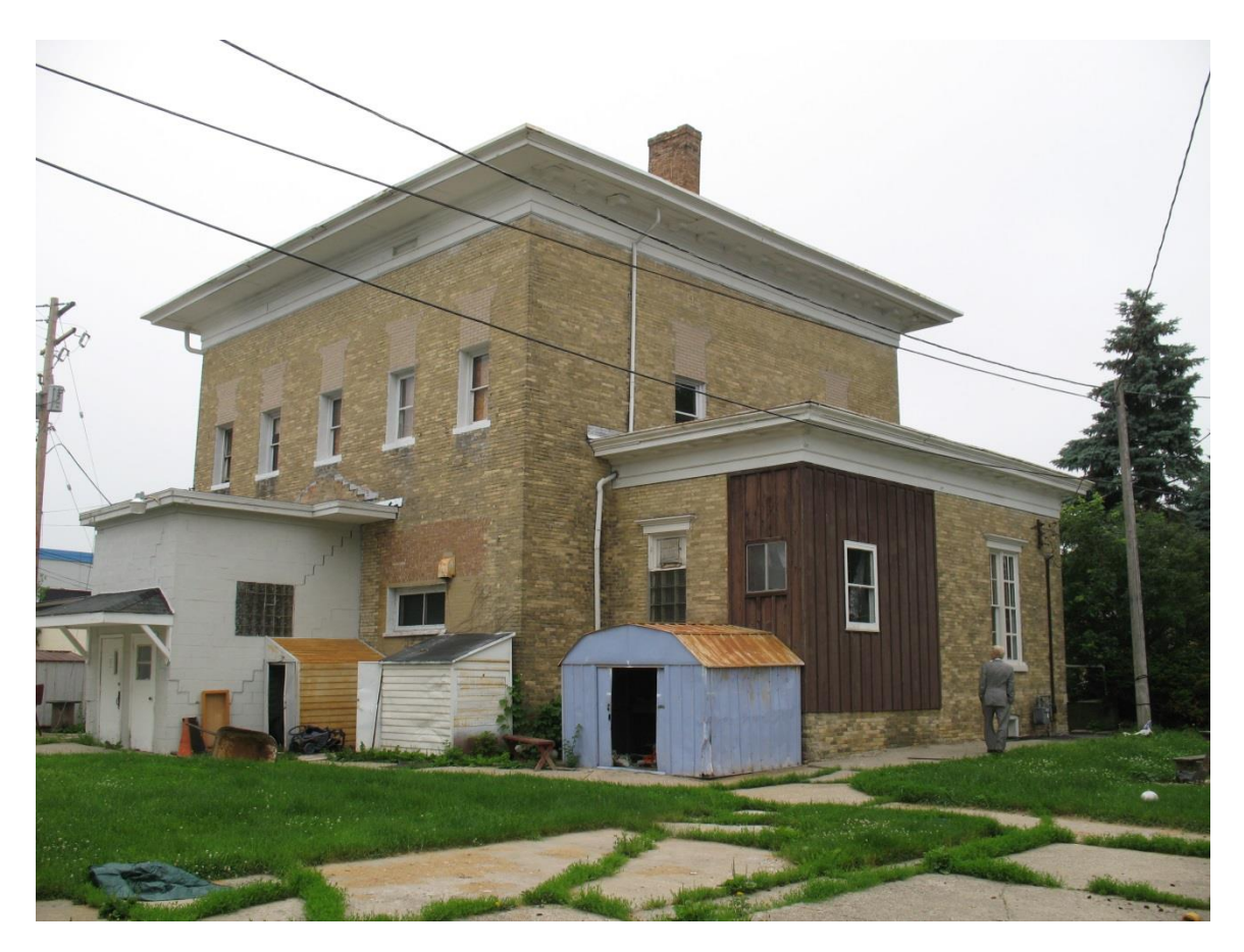
Jacob Nunnemacher Estate / Wildenberg Hotel Rear Elevation Looking Southwest