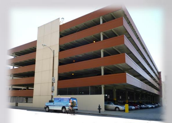
MILWAUKEE AND MICHIGAN