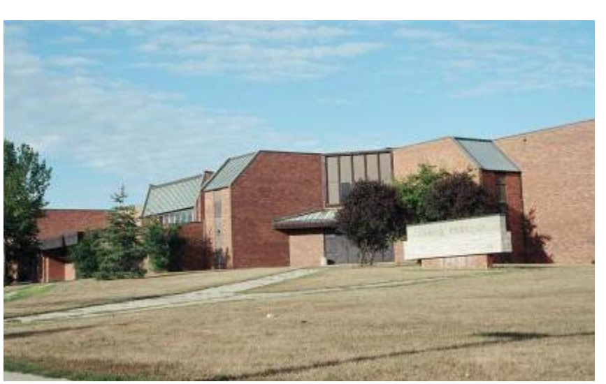
Webster Middle School

Leased to Universal Charter Schools, a national charter school organization