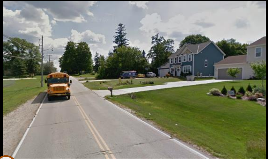
3 View to the south (from the western edge)