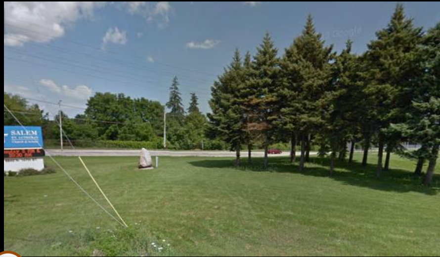
2 View to the east