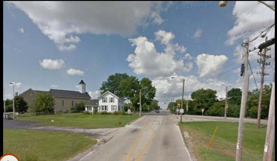
1 View to the north (from the western edge)