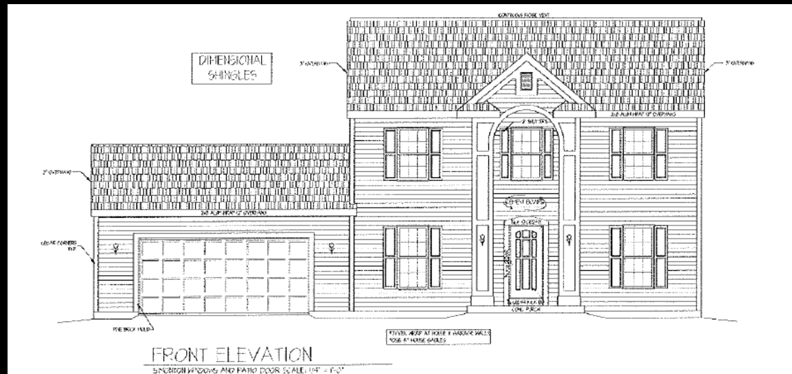
East (North 107 th Street) elevation