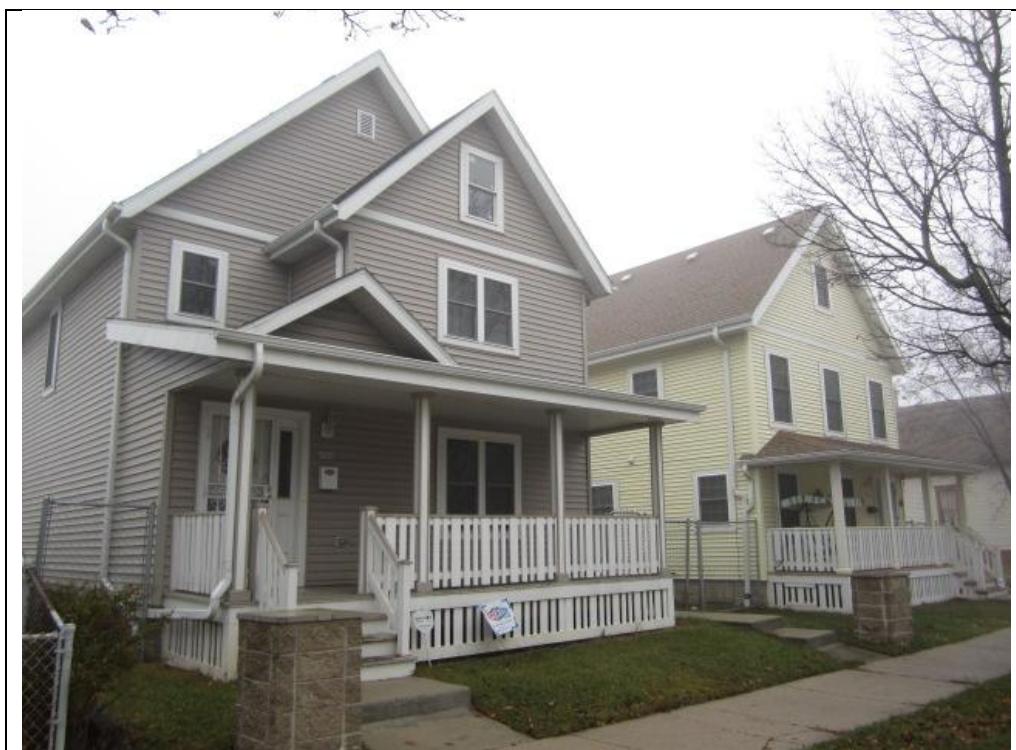
Fresh Start/Youthbuild Houses

Two single-family homes constructed by Northcott's Fresh Start/Youthbuild program that will be sold to owner-occupants upon completion. The houses will be two and one-half stories tall with four bedrooms and two bathrooms. The house designs are compatible with the neighborhood in terms of scale and design with front porches and two-car garages with alley access. The house at 2616 will be fully accessible with ramps and an elevator. This project is funded with CDBG HOME funds. Construction costs are expected to be about $400,000 for both homes. Final cost to an owner-occupant will be between $140,000 and $150,000.