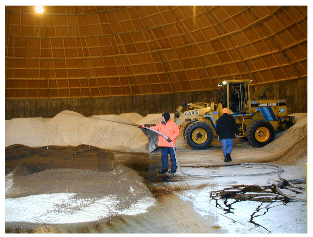
City staff spraying GEOMELT® onto rock salt

A pilot test of GEOMELT<sup>®</sup> (beet juice) was conducted beginning in December 2009. The product claimed to lower the freeze point of salt brine down to -30F and leave a residual on the pavement longer which would equate to less salt use and cost savings.