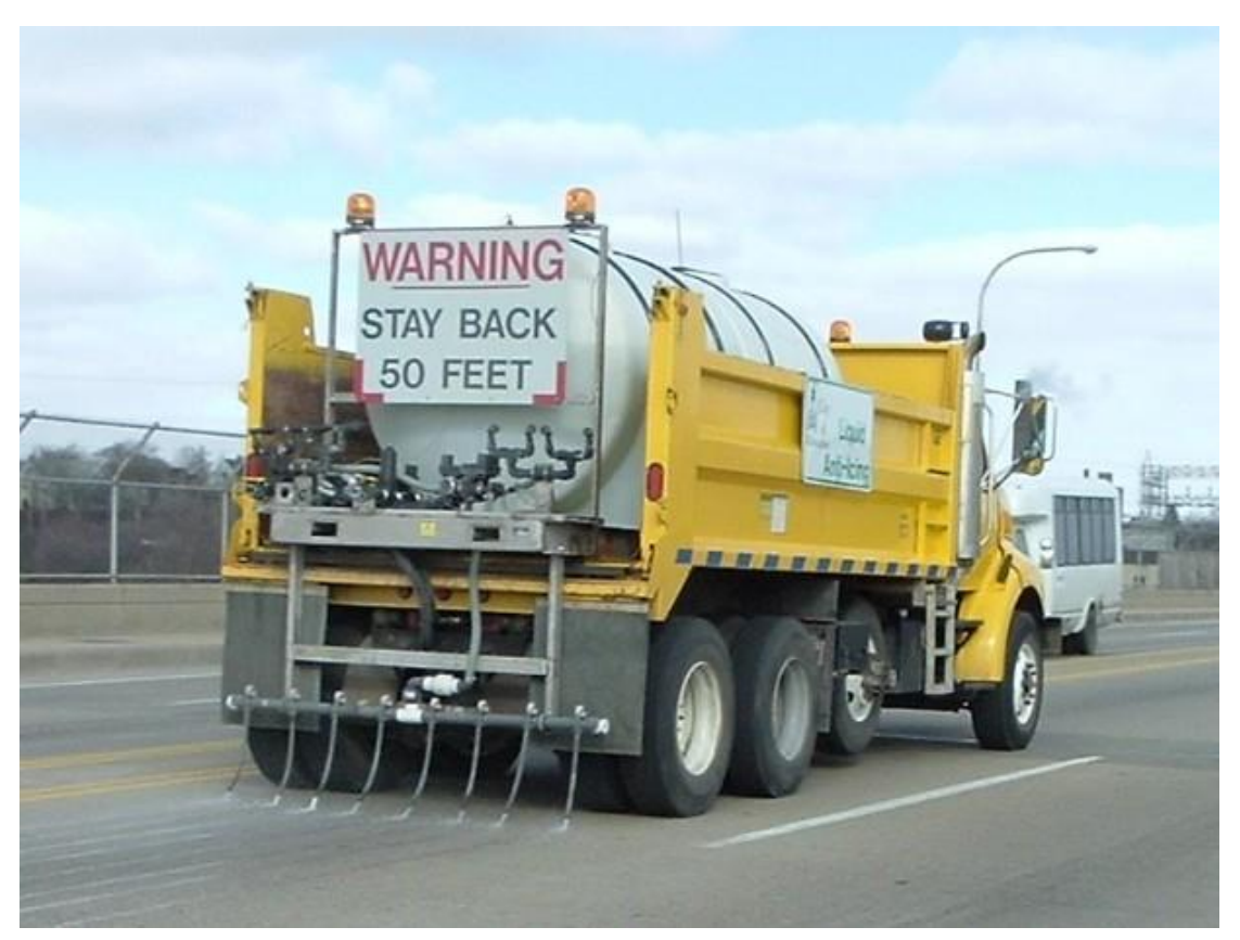
DPW truck applying brine to the pavement over a viaduct

Anti-icing with brine is effective only under certain conditions: dry roads, pavements above 20 degrees, no rain or blowing snow forecast for 24 hours and a dew point at least two degrees lower than the temperature.