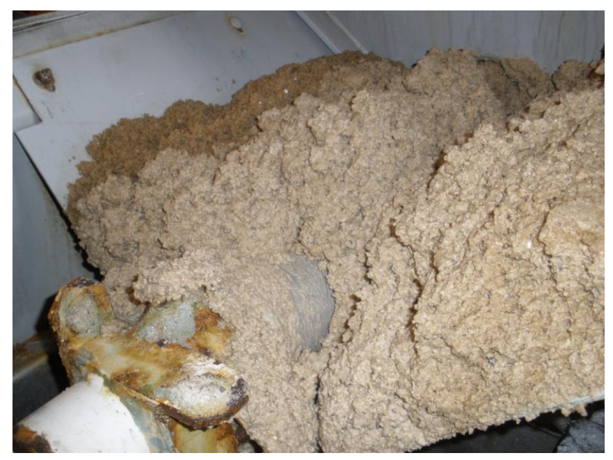
GEOMELT55® treated salt in the hopper of a salt truck

Four routes on the north side of the City tested the product. The salt was too wet initially and caused tunneling problems in the truck's hopper. Several other attempts failed as the salt turned to a sticky, oatmeal like consistency in the truck. Trucks had to be emptied, washed out and refilled with dry rock salt during an ongoing general ice control operation.