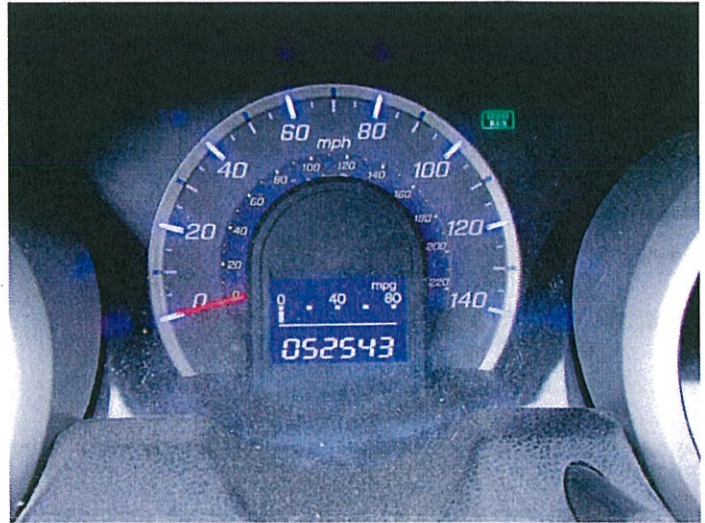
Odometer reading 3:55pm 2/13 2013