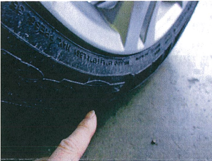
Bulge in left rear tire - detail