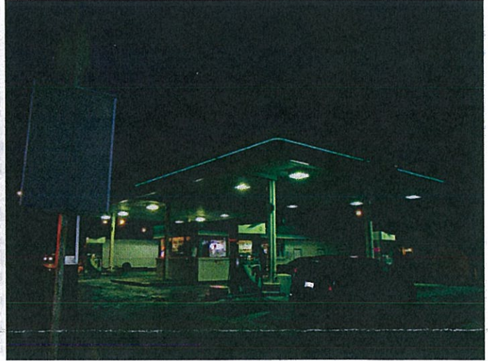
Wheel Stuck, AAA contacted, Location: BP station: 60 th and Fond du Lac. 2/11/2013 6:14am & 6:35am