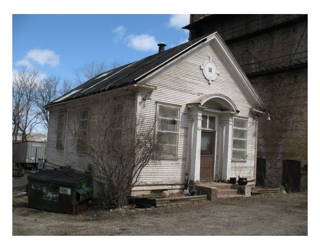
Office Front (South) Elevation