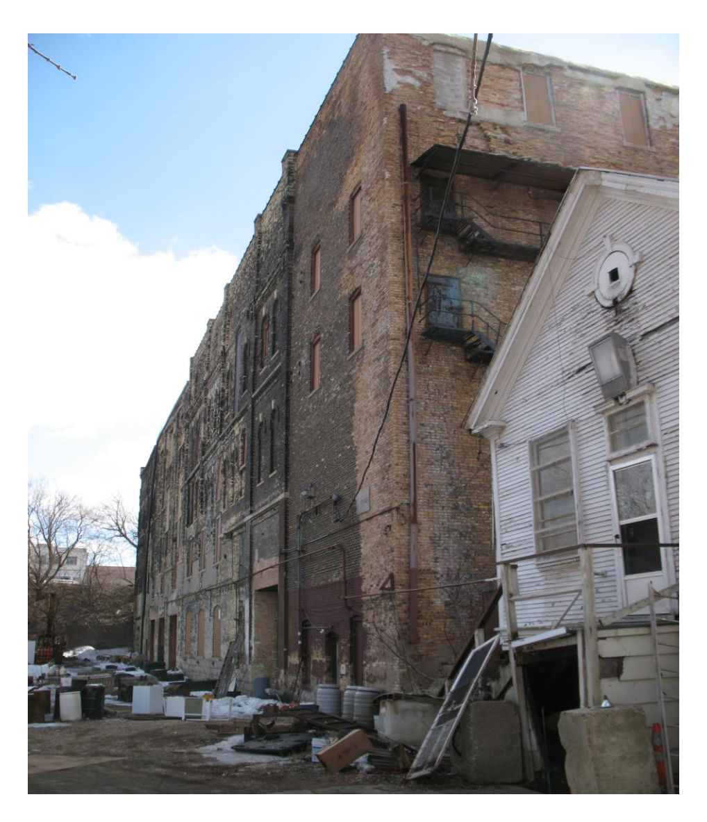
North Elevation Ice House/Malt House