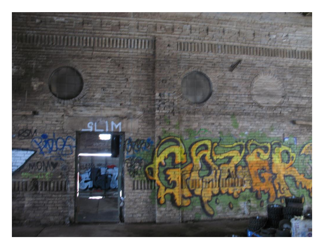
Stable Original West Wall