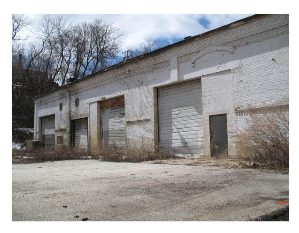
Stable Front (East) Elevation