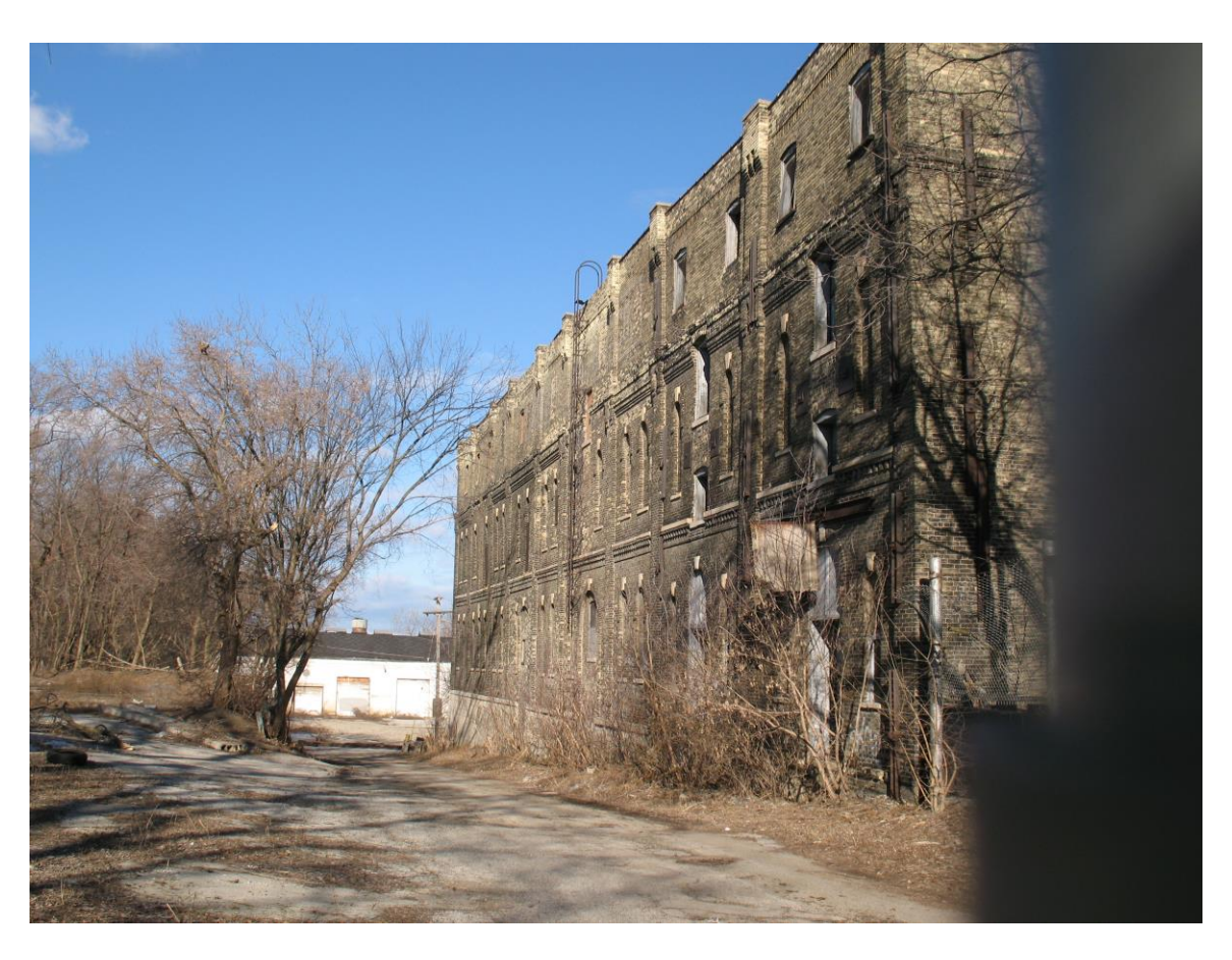
South Elevation Ice House/Malt House