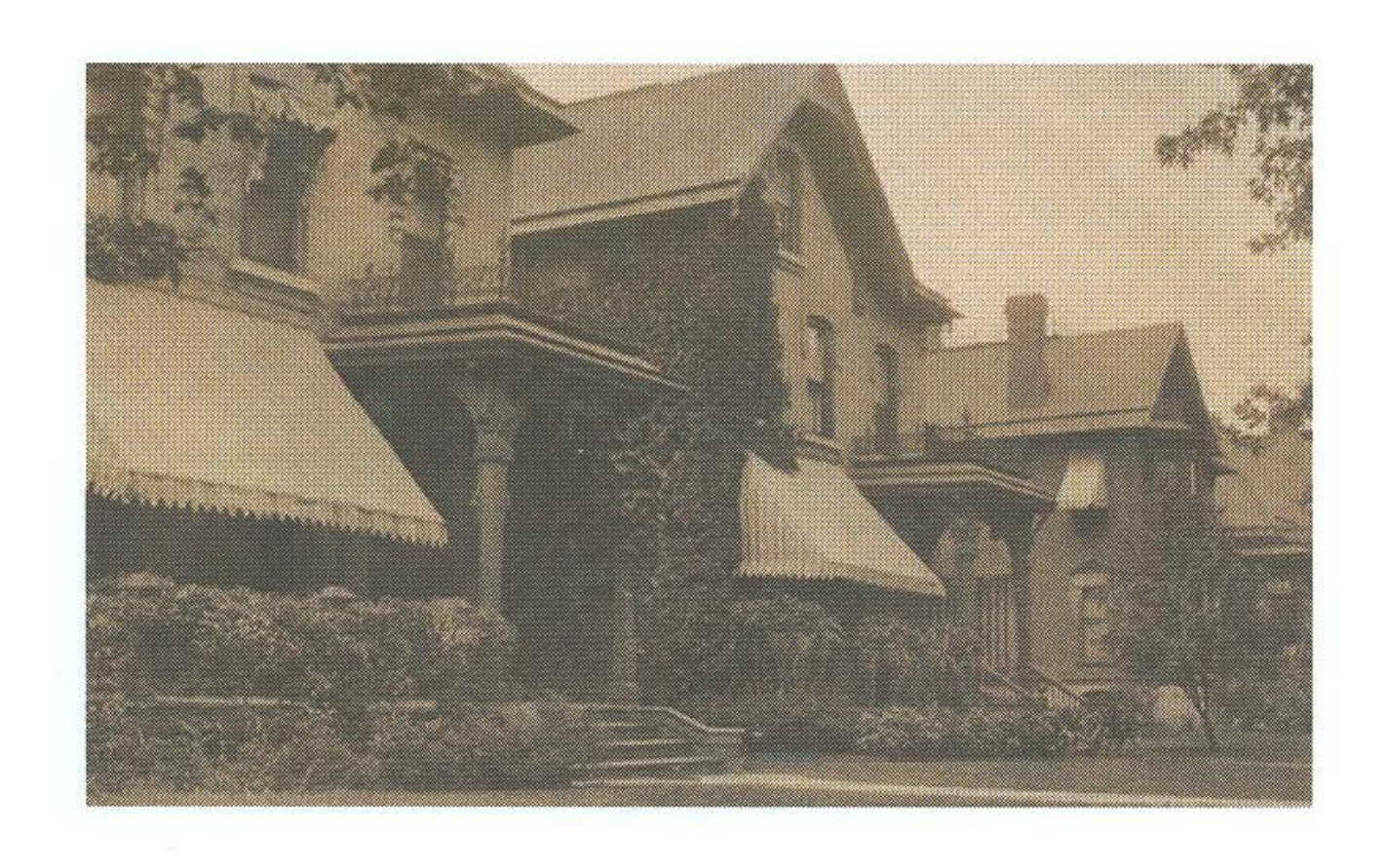
1879 North Cambridge (left) 1903 North Cambridge (right) with awnings