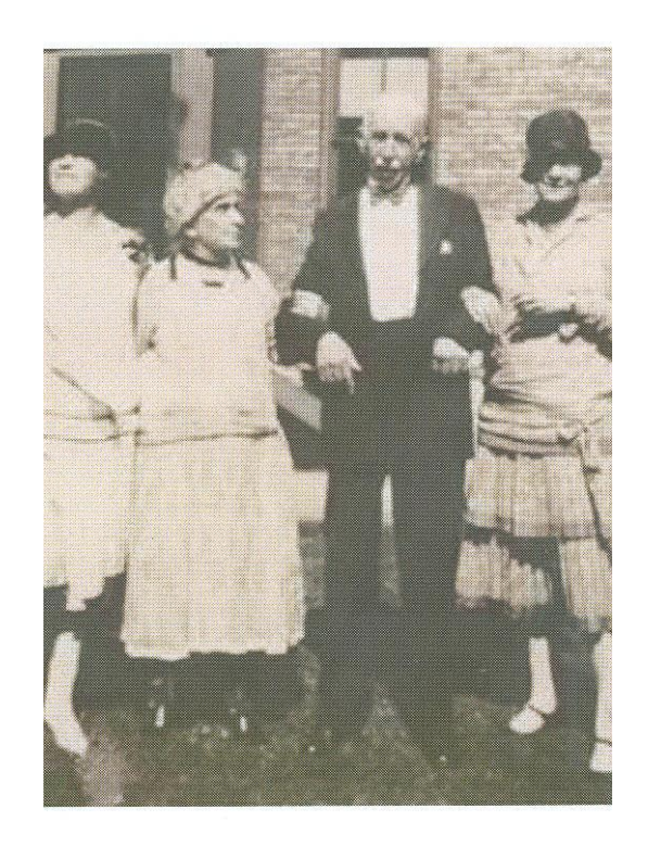
GROOM FAMILY ON CAMBRIDGE AVENUE