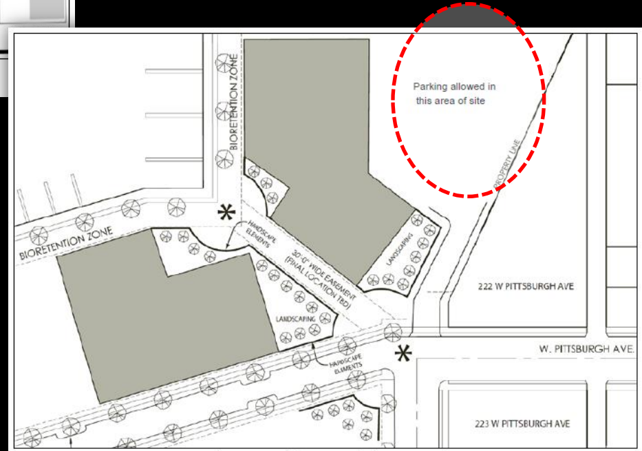
Diagram F (Site Special Features)