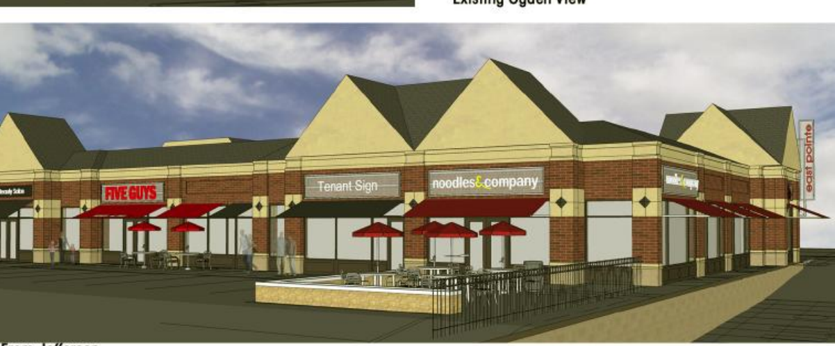
View From Jefferson

Signs to be Type "A or B" as defined by Milwaukee City Ordinance. Type "B" signs can only be mounted to screens that are less than 50 square Feet.