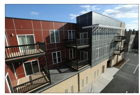
Phase III MIlxed-Use Buildina

Phase IV involves construction of 35 to 40 units of affordable rental housing on scattered sites in a combination of townhouse and single-family buildings. The MPS parking lot will be used for either three single-family units or may be suitable for townhouse construction. The units will be rent-to-own where occupants can build up equity during the rental period and purchase the units at the end of the compliance period for affordable rental housing.