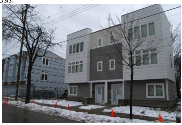
Phase II Rowhouses