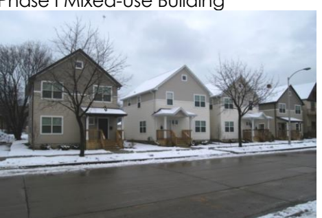
Phase II Single-Family