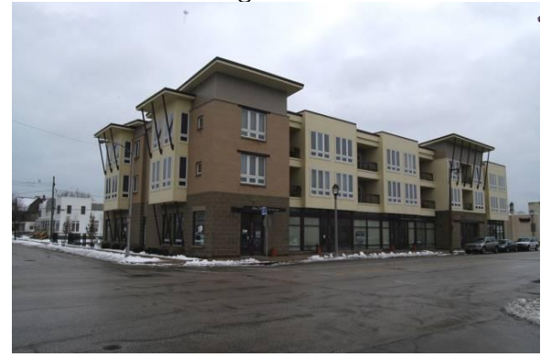
Phase I Mixed-Use Building

In December 2010, the Common Council authorized sale of Redevelopment Authority property for the Phase IV of King Commons. MLKEDC began King Commons in 1999 as a comprehensive commercial and residential redevelopment from 1st to 7th Streets and between Center and Locust. Its efforts have resulted in three mixed-use buildings on King Drive and a total of 66 housing units in these buildings and on a scattered site basis.