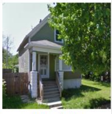
2825 N. 10<sup>th</sup> Street 1 Unit

The rehab rental project will consist of a minimum of 24 affordable rental units, two to four bedrooms in each, with each unit averaging 1,250 sq. ft. in size. The target market is households with incomes that are 30%. 50% and 60% of the Area Median Income. The developers will be bound by a 15-year tax credit compliance period, which ensures that the properties will remain under common ownership, which ultimately adds value and stability to these neighborhoods. Total project costs are estimated at $3.3 million.