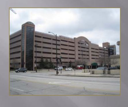
4<sup>TH</sup> AND HIGHLAND