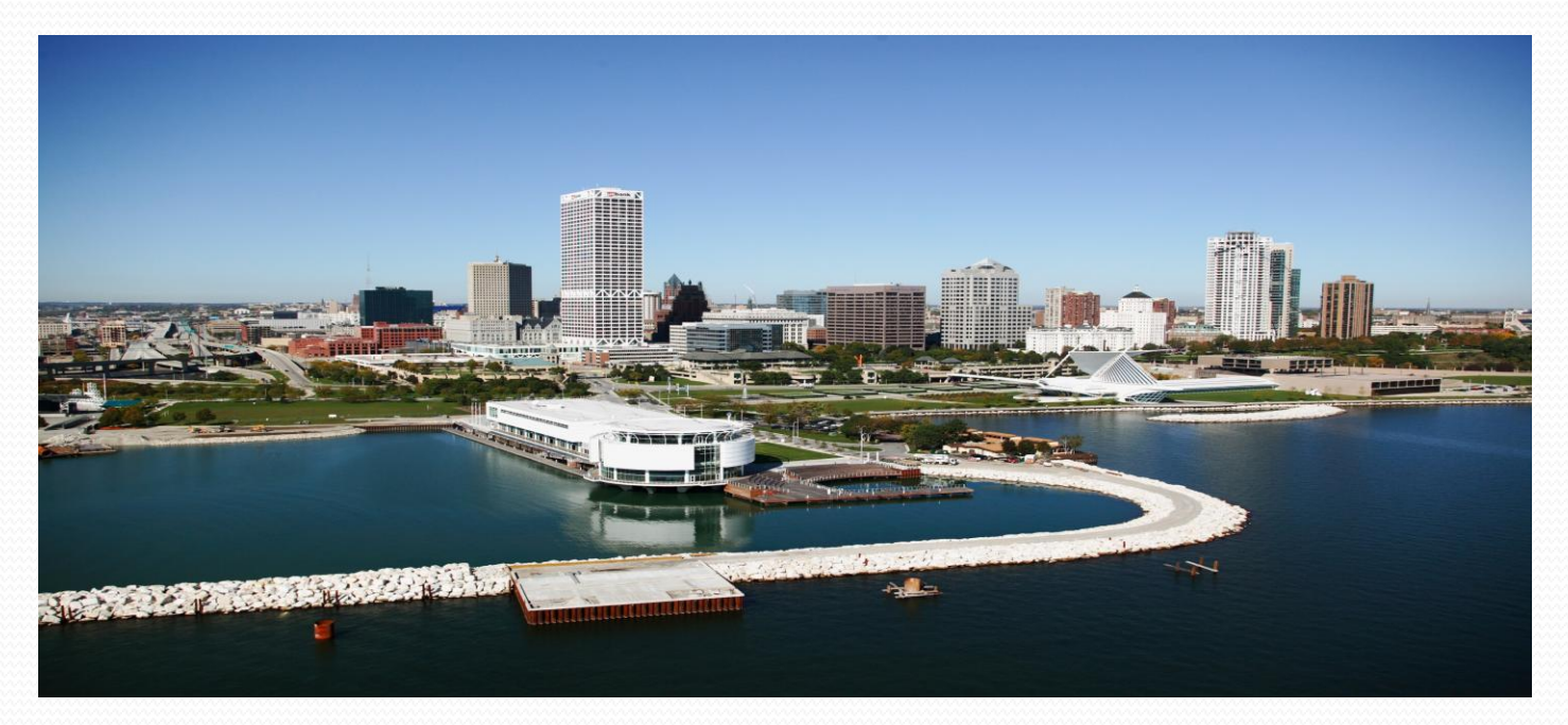
2010 Annual Report Expenditures & Activity through December 31, 2010 Department of City Development