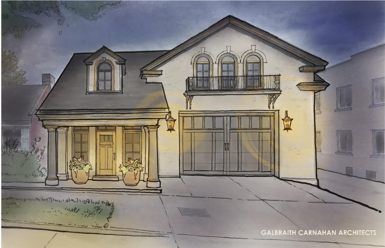
Conceptual Rendering of 2509 West Capitol Drive (South view)