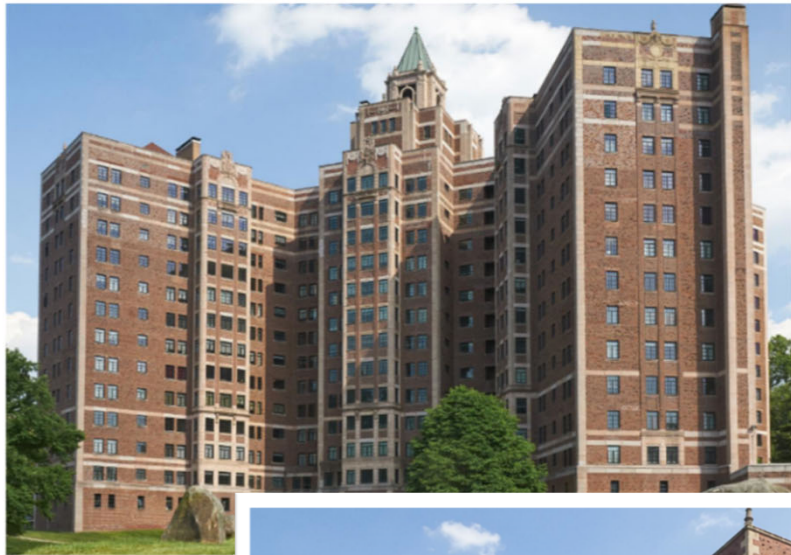
Alden Park Philadelphia