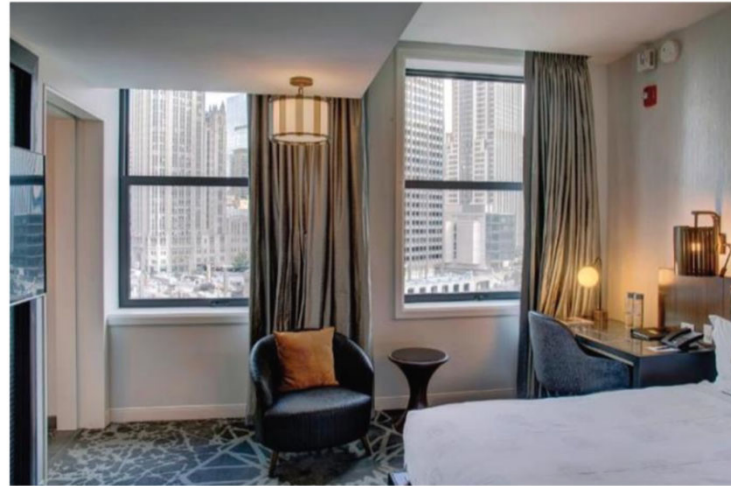
The London House Hotel, originally the London Guarantee & Accident Building