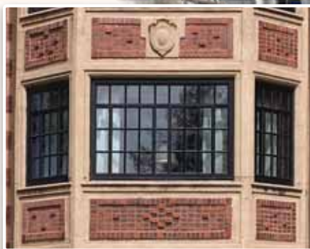
Alden Park Manor in Philadelphia, PA, before and after window replacement