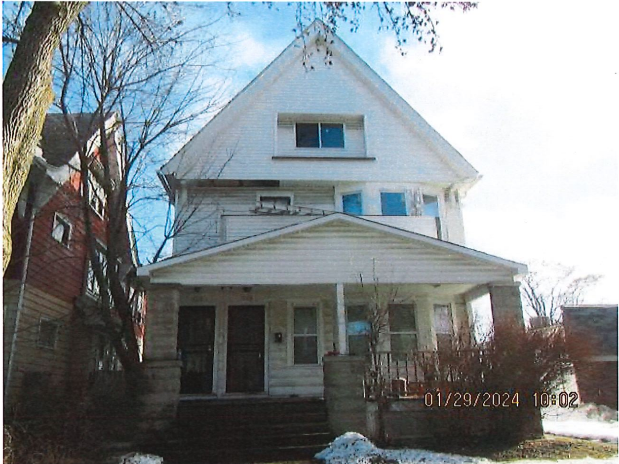
Above: Photo of the Subject Property (2312-14 North 41 st Street)