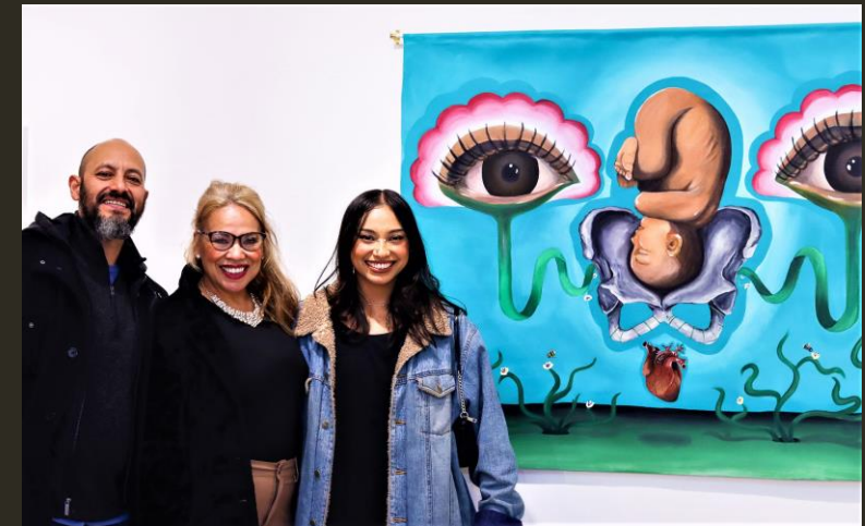
Latino Arts – March 3, 2023 - An exhibit featuring female artists reflecting on relationships with individuals that have played a maternal figure role in each of the artists' lives, focused on the stories of these relationships and the lessons learned.