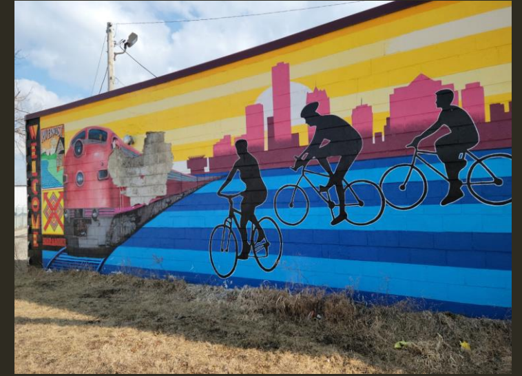
$3,000 for the Riverworks Development Corporation Beerline Trail Train Mural conservation