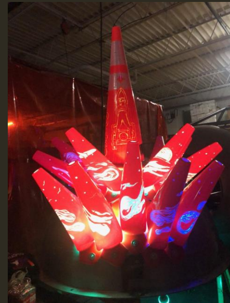
(left) a community member prints a visibility patch at the Vision Zero Open House – (right three) cones carved to be attached to the "art car" which is sketched center.