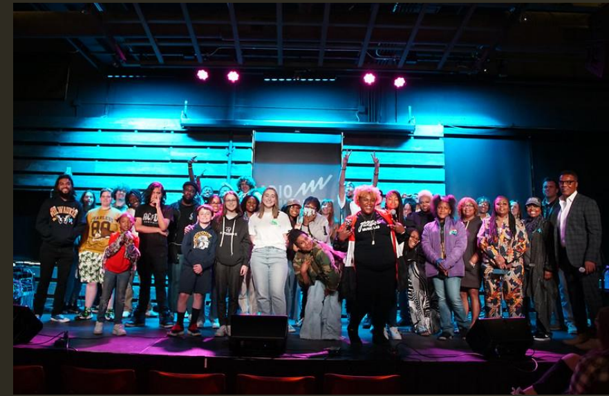
Radio Milwaukee's Music Lab – May 24, 2023 - open house with students, parents and community members with a great conversation about believing in yourself plus student open mic performances.

-373,081 people were served (audience members, gallery attendees, zoom views, listeners, etc.) over at least 67,932 sessions