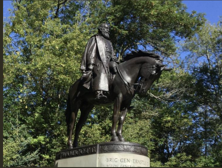
$2,000 for the Lake Park Friends conservation of the Erastus Wolcott Memorial