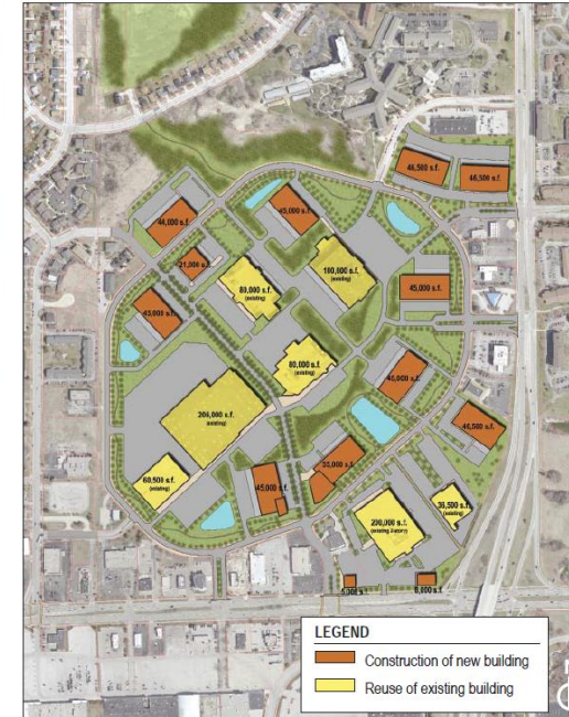
Figure 4. Conceptual site plan for the former Northridge Shopping Center (Option A).