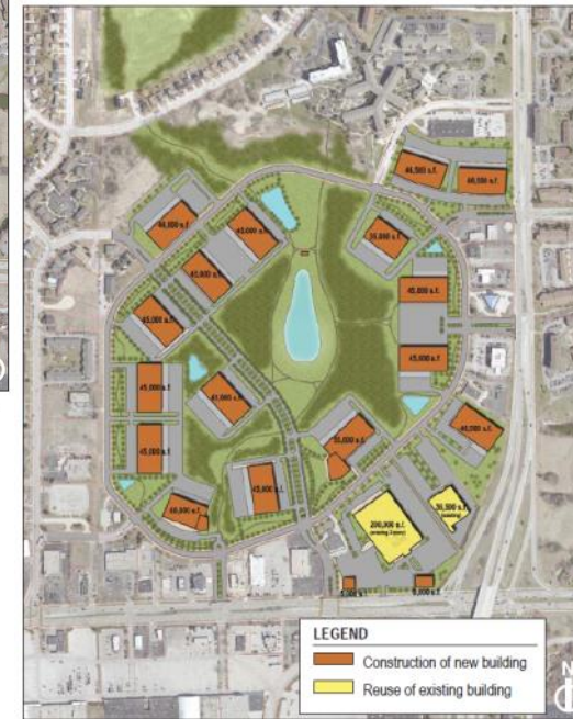
Figure 5. Conceptual site plan for the former Northridge Shopping Center (Option B).