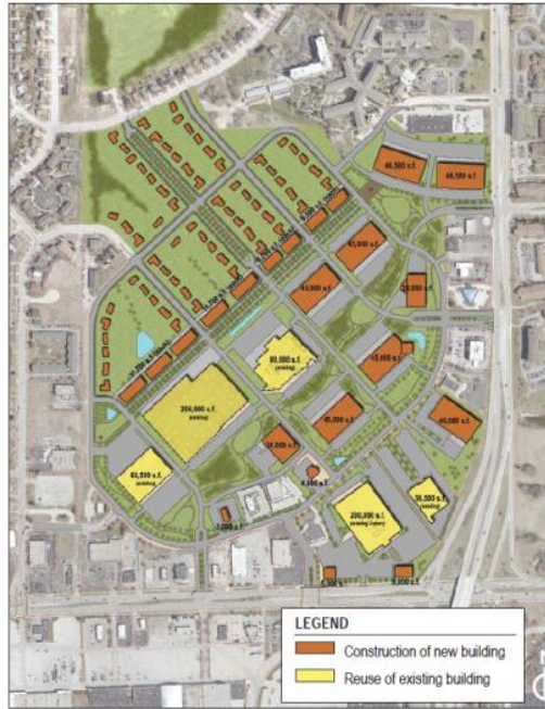
Figure 6. Conceptual site plan for the former Northridge Shopping Center (Option C).