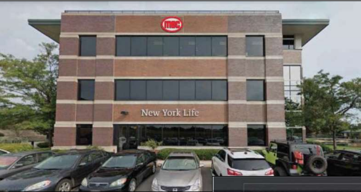
File No 231762. Future Tenant Sign