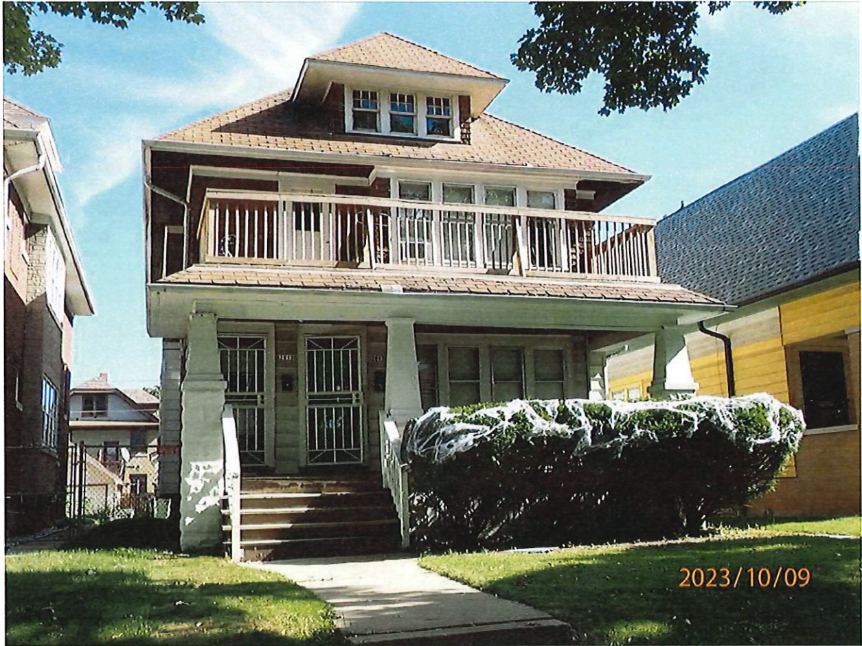
Above: Photo of the Subject Property (2808-10 North 48 th Street)