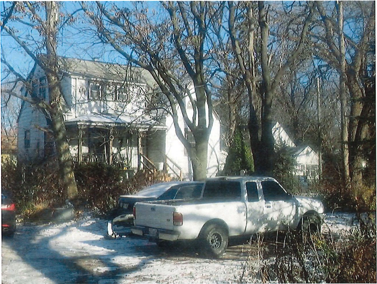
Above: Photo of the Subject Property (7020 W Mill Rd)