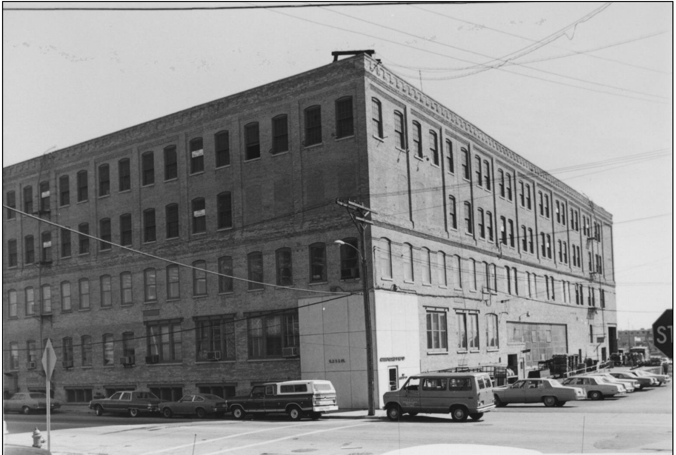
Wisconsin Historic Preservation Database, March 1980 photograph (WHPD #110095) North & west elevations