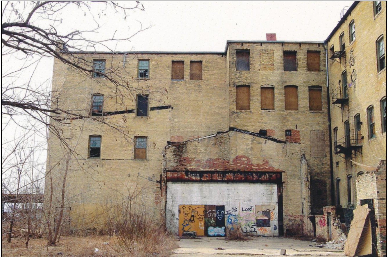
Wisconsin Historic Preservation Database, 2018 photograph (WHPD #110095) East elevation – appearance of the building when National Register-listed in 2018