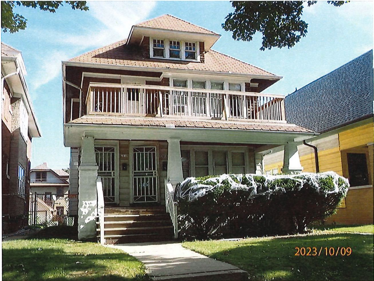
Above: Photo of the Subject Property (2808-10 North 48 th Street)