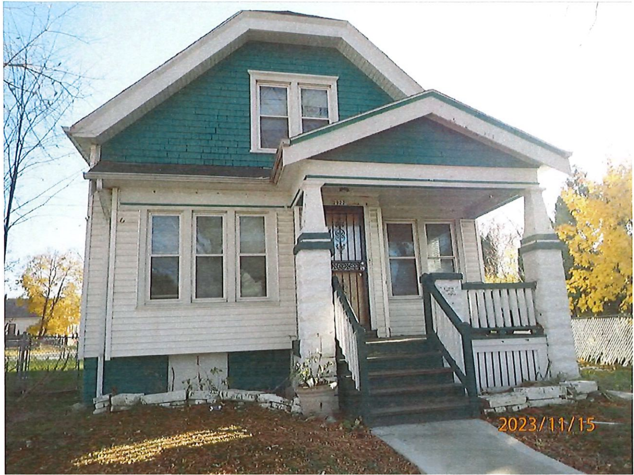
Above: Photo of the Subject Property (2922 North 16 th Street)