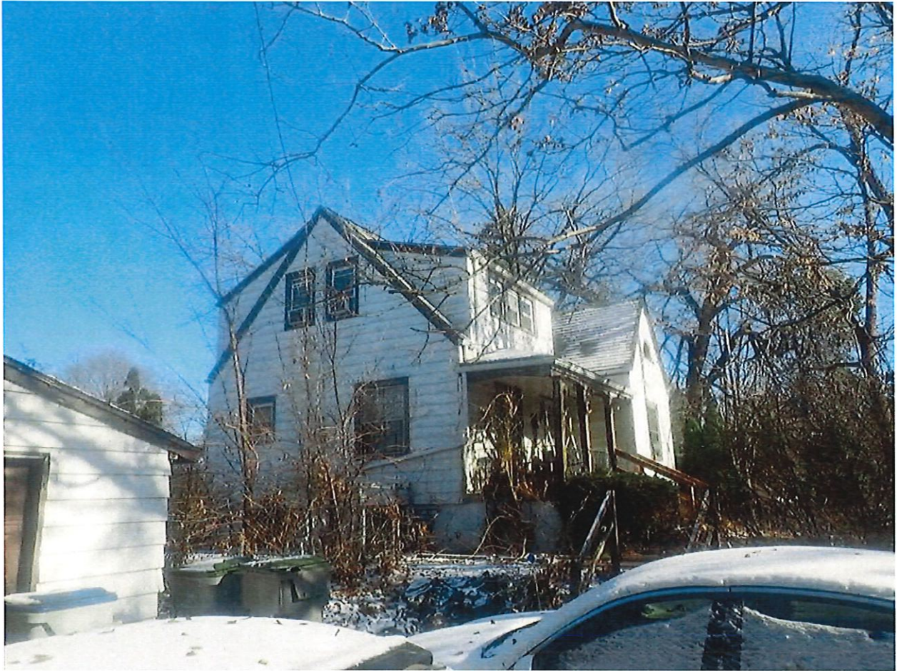
7020 W Mill Rd