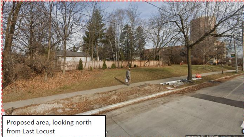
Proposed area, looking north from East Locust