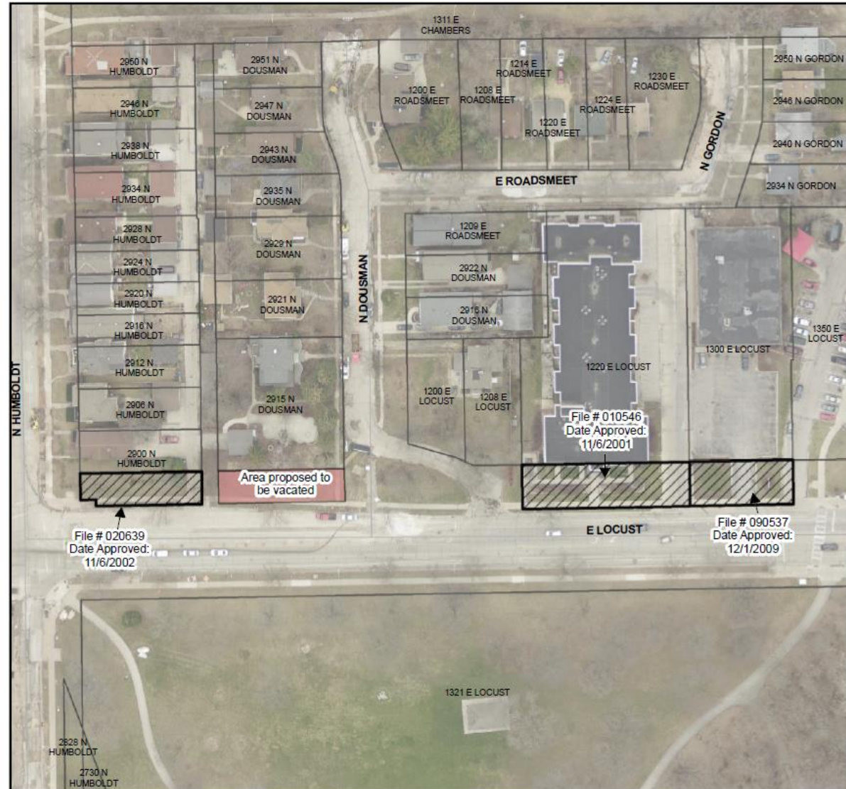
Surrounding Vacation History

File # 230724 Proposed Vacation at Locust and Dousman