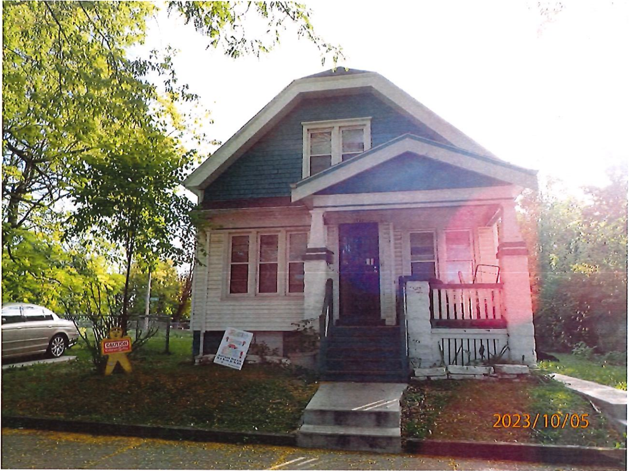
2922 North 16 th Street