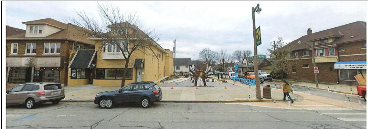
VIEW TO SOUTH OF 5529-31 WEST NORTH AVENUE

5529-31 West North Avenue, a 4,800 square foot City-owned lot, to be leased for park and community space.