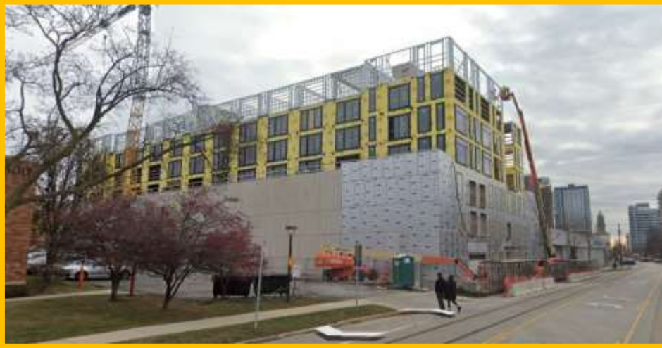
View from Jackson St looking southeast