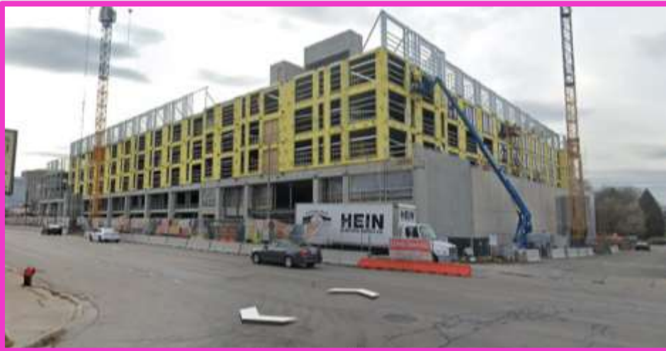
View from Van Buren looking southwest