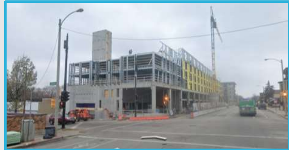
View from Van Buren looking north