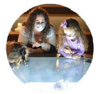
150,000 kids inspired annually