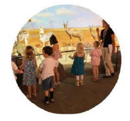
Field Trips from 44 WI counties every year