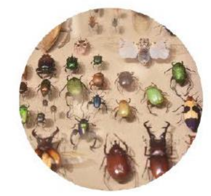
4 million objects & specimens from every WI County to deep in space