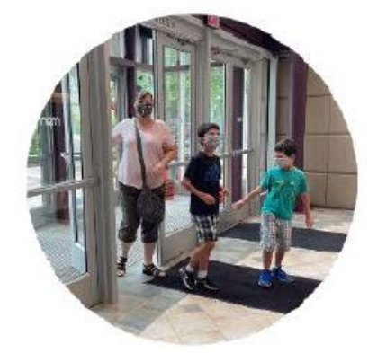
500,000+ visitors every year