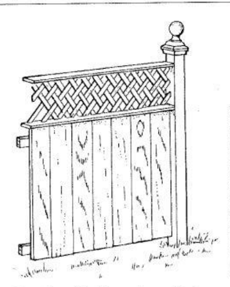
Board and lattice, also called a "treillage fence"