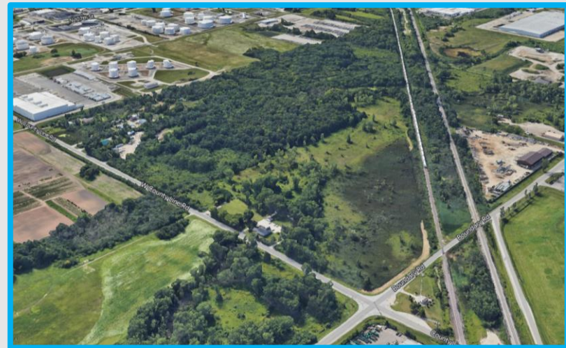
Aerial view looking southeast