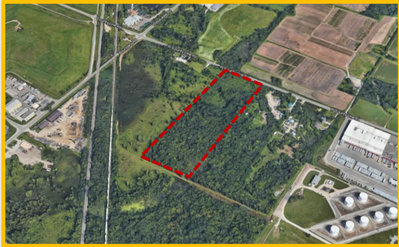
Aerial view looking northwest