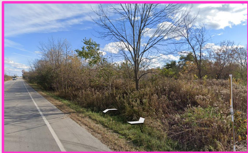
View from County Line Rd looking southeast