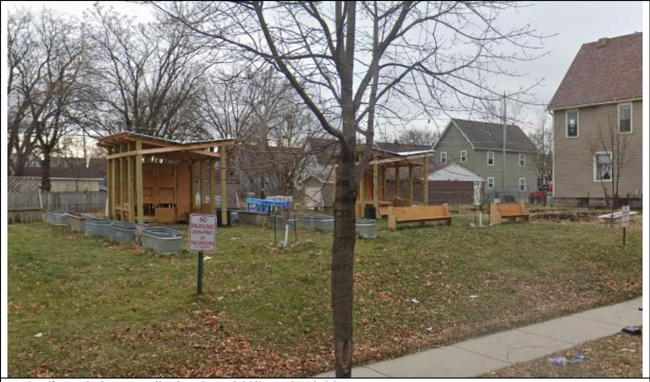
Metcalfe Park Community Garden at 28th and Wright